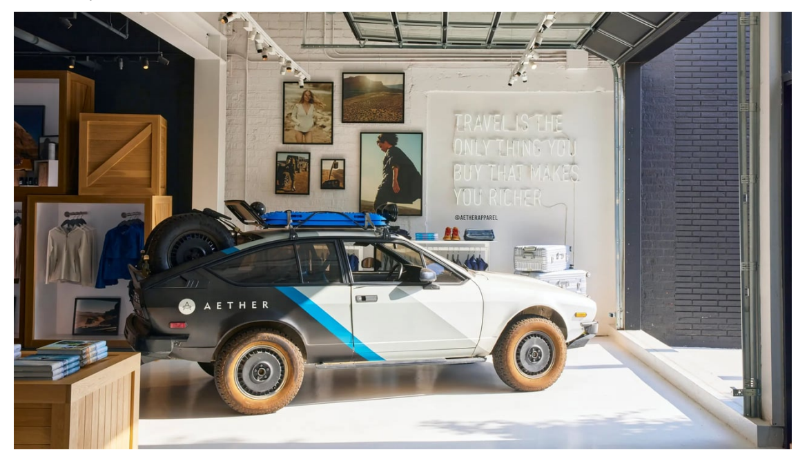
Hosted in collaboration with 'outfitters of the restless', <u>Aether</u>, their flagship store looks to be the perfect spot for an intimate gathering. As the sun starts to dip into the Pacific, 7pm will make way for festivities to begin, where we have no doubt conversation with delve deep into the craftsmanship and artistry of vintage Italian automobiles, with excerpts from Gestalten's book providing plenty of information should anyone need it. We've also heard rumours that there'll be a surprise Italian classic or two that will make an appearance on the evening, something we are very intrigued to see!

There are die-hard Tifosi stretching all corners of the earth, but there are few places that celebrate car culture quite like Los Angeles. It's a melting pot of genres, styles and history, culminating in a rich and diverse community of car lovers, who are treated to some fantastic driving roads along the way. Therefore, the sun-kissed backdrop of LA, and more specifically La Brea Avenue is the ideal place for <u>Gestalten</u> to host an aperitivo-filled evening that commemorates Italian design masters and a chance to pick up their new book for yourself.