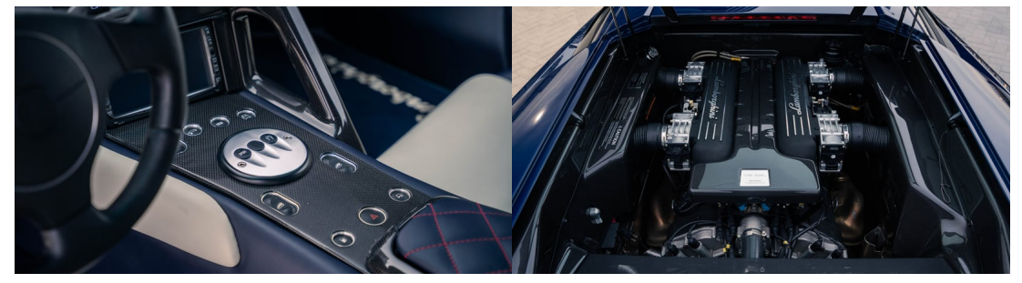
Step inside, and you'll notice the demure exterior is hiding a slightly more flamboyant cabin. The blue and white leather interior works marvellously, though, especially with that contrasting red stitching. Arguably the only thing we'd change about this Murciélago is the gearbox: this one has the 6-speed "e-Gear" automated manual transmission. While it might not be quite as sweet as a manual, we have heard good things about the emotive gearshift that this box offers, especially compared to the clinically efficient DCTs found in modern Lambos. So, if you've always loved the Murciélago's iconic 'bat wings', but don't want the colour to shout as much as the V12, then look no further than this modern classic.