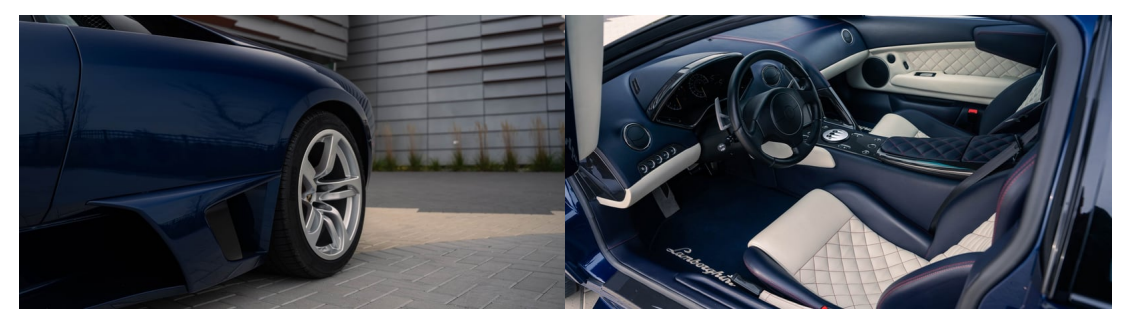
Much like the Diablo that preceded it, the comparatively restrained lines of the Murciélago only seem to ripen with time, and we couldn't imagine a better specification than this example for sale with LBI Limited. Not only is that dark blue metallic exterior perfectly understated, but the silver wheels also add a touch of eye-candy, lifting the overall look. Showing just over 4,000 miles on the clock, this Murci's 6.5-litre, 631hp V12 is ready to scream around your best local roads.