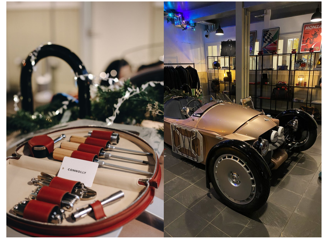
Of course, the rose-gold, three-wheeled machine in the middle of the room came courtesy of Morgan themselves, showcasing the all-new Super 3 complete with a host of optional extras that encourage adventure. The striking new design and durable interior was a real talking point amongst our visitors, with many itching to take one for a spin - us included!