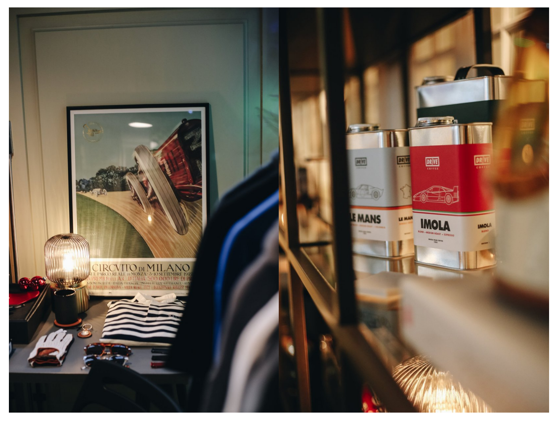
Being a typically wintery few days in the capital, the temperature ensured both staff and visitors got to try on a variety of clothing from iconic British outfitters Connolly, as well as some Teddy Jackets from Motoluxe, and other winter apparel from <u>Malle London</u>, <u>Easy on the Extras</u>, <u>Recaro</u> and <u>Private White VC</u>. These winter warmers certainly helped ease the chill, as did the constant supply of delicious coffee kindly shipped over from the USA by <u>Drive Coffee</u>.