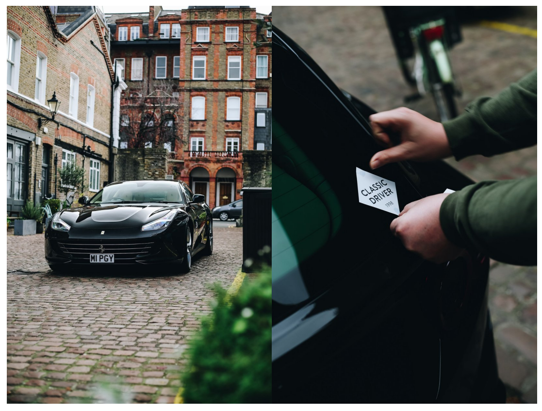
Tucked away in one of Kensington's idyllic Mews streets sits one of Morgan Motor Company's home-from-homes, a beautifully restored experience centre filled to the brim with models from their rich past and ever-exciting future. Alongside the main showroom sits a small storage garage, which made for the perfect space for our Christmas Pit Stop.

Lead Spread over three days, the Classic Driver team curated a diverse and stylish array of items available from the CD Shop to make for the perfect Christmas pop-up store. Read on to find out more.