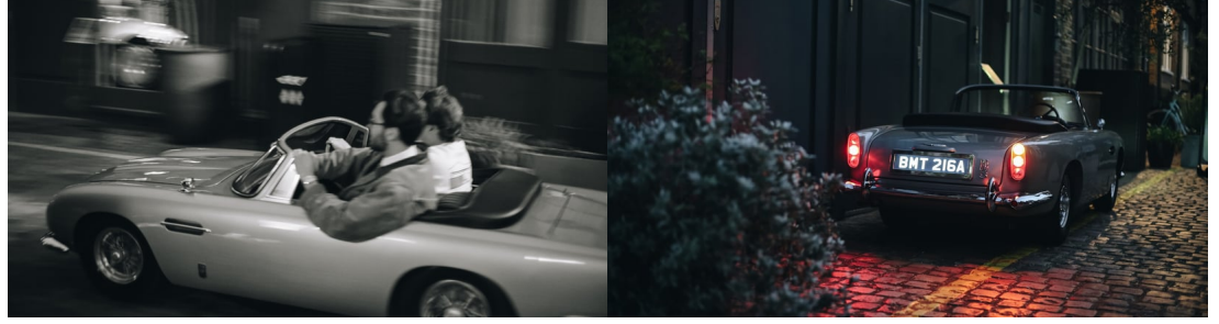
Perhaps the star of the show is awarded to the four-wheeled machine parked outside the pop-up, a 60% scaled version of 007's Aston Martin DB5 from<u>The Little Car Company</u>. Loaded with working gadgets straight from Q's arsenal, this fully electric Aston brought a steady crowd of onlookers, all itching to see the smoke screen and changeable number plates in action. Even more four-wheeled fun came from <u>Banzai skateboards</u> and their incredible array of hand-crafted metal boards, fresh from Santa Monica.