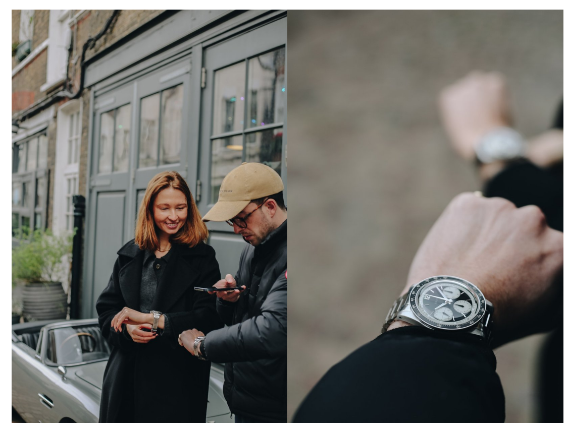
There's nothing we like more than a good accessory, and our Pit Stop ensured even the smallest of items got the spotlight they deserve. Some of our highlights include Bennett Winch luggage, the finest leather goods from Café Leather, Unimatic Watches, Connolly's pre-war style race goggles and some great looking shades from Ed Scarlett when the sun finally made an appearance. Each considered item was displayed to flow effortlessly as visitors made their way around the shop, in which the walls featured a smattering of drama and vibrancy from Automobilist prints, as well as some stunning pieces from visual artist Alan Thornton. As for the drivers and riders who visited us, their eyes were often locked onto Hedon Helmet's latest creations, inspired by space-age pop culture and 1970s colour palettes to create a modern-day helmet with the coolest of retro flair. Another big talking point came from Baltic Watches, and their latest offerings inspired by Paul Newman's iconic Daytona.