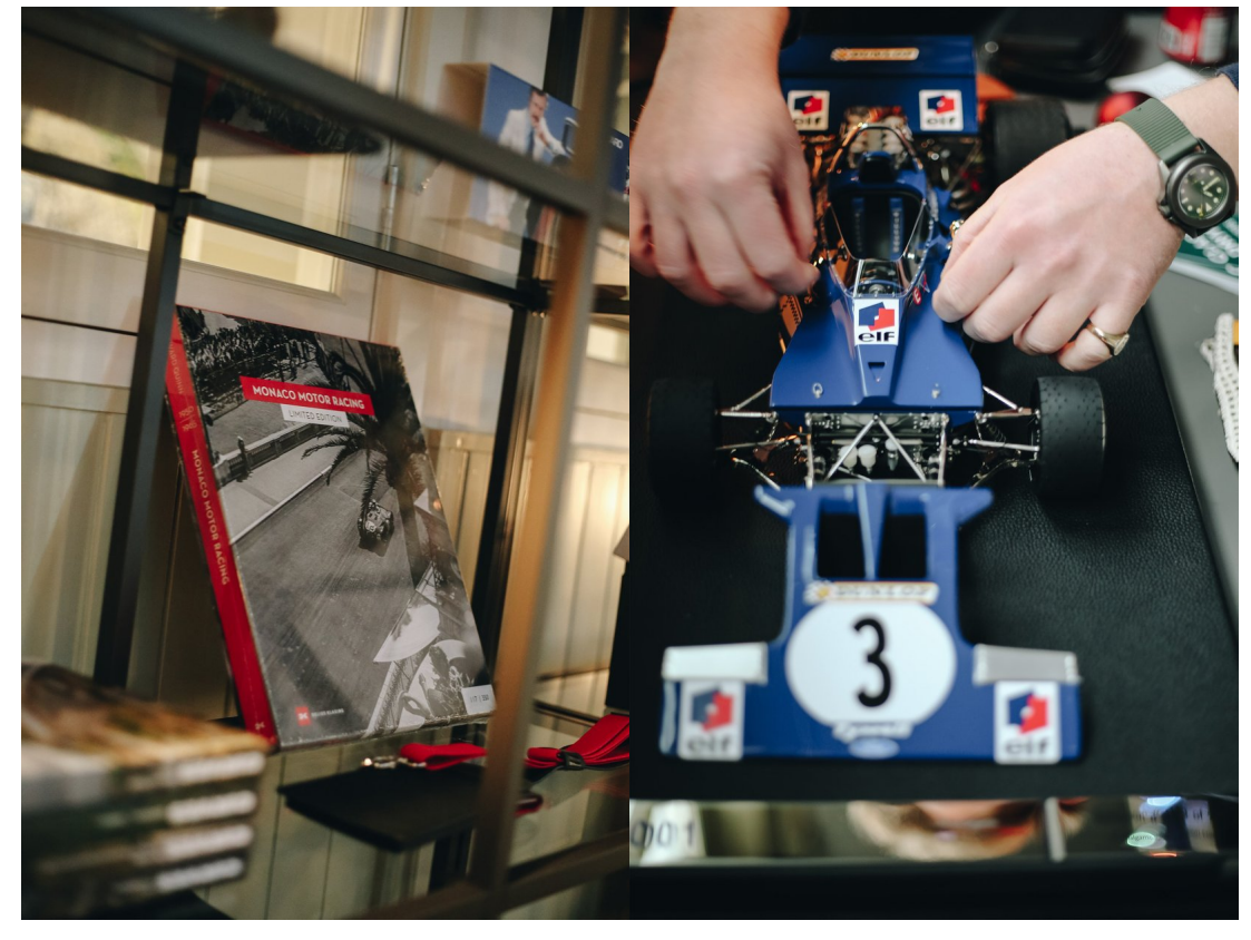
On display around the pop-up shop were some of our favourite pieces, as well as some ideal gifts for petrol-headed loved ones. Visitors were able to skim through the latest book releases from Coolnvintage, Porsche Unseen, and Curves Magazine all carefully curated alongside related models from the Amalgam Collection.