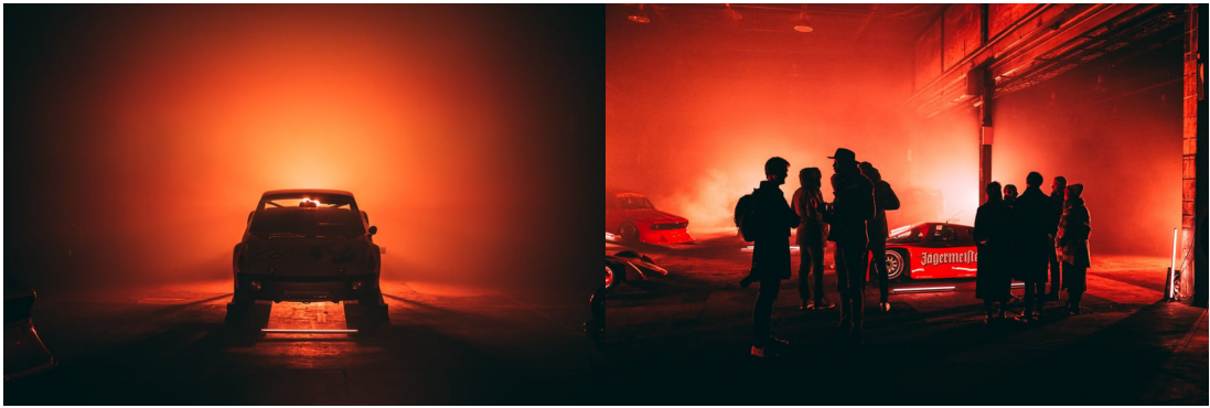
The line-up of cars at Belgienhalle – an industrial off-site venue and subcultural hub in West Berlin – included hero cars from different eras of Jägermeister Racing. Among the early cars, there was a Porsche 914/6 GT that introduced the world to the orange Jägermeister livery in 1972 and a Brabham Formula 2 monocoque racecar from the same year that was piloted by Graham Hill, the only driver to ever win the F1 world championship, the 24 Hours of Le Mans and the Indianapolis 500.