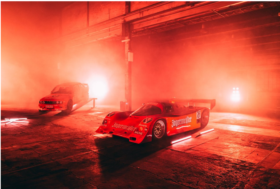
The latest car in the pack was a true legend of the Nürburgring, a 1992 BMW M3 Sport Evolution that many of us remember from the hay days of the German Touring Car Championship DTM, where it was piloted by Armin Hahne. All five cars were displayed in an artful installation created by the Rennmeister team that presented the orange racing machines in their full functional beauty; as sculptures shaped by aerodynamics, adrenaline and speed.