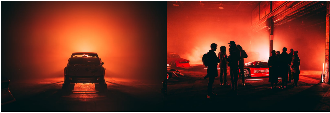
The line-up of cars at Belgienhalle – an industrial off-site venue and subcultural hub in West Berlin – included hero cars from different eras of Jägermeister Racing. Among the early cars, there was a Porsche 914/6 GT that introduced the world to the orange Jägermeister livery in 1972 and a Brabham Formula 2 monocoque racecar from the same year that was piloted by Graham Hill, the only driver to ever win the F1 world championship, the 24 Hours of Le Mans and the Indianapolis 500.