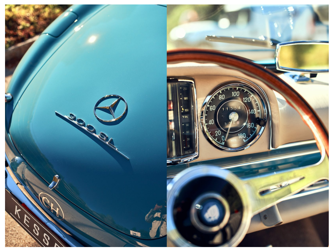
While many opted for the more conventional Bright Silver to showcase the SL's unrivalled design language, this example holds its original shade of 'Hellblau 334', a gloriously bright pastel blue that works perfectly with the cream leather, which was added in place of its original blue leather. Amongst the abundance of cow hide and chrome, you'll discover some rare and highly desirable optional extras fitted to this example, including a Nardi steering wheel and a detachable hardtop roof finished in a light grey metallic. The ultimate road trip accessory can be found in the large boot of the SL: bespoke luggage that fills the entire space, allowing more than enough room to pack those holiday essentials.

As effortlessly cool as the gullwing doors were on the coupé variant, removing the roof meant the entire body had to be redesigned for the roadster. Mercedes decided to lower the chassis at the door line to allow a conventional door to be fitted, giving the drop top a look many actually preferred. Even better, the Roadster was also a little more dignified to enter and exit.