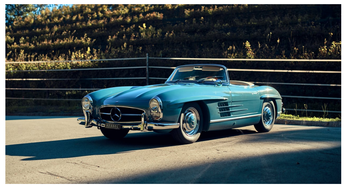
As style icons go, the 300 SL Roadster is among the elite, looking unlike anything else on the road from the 1950s, and even today still blends futuristic space-age styling with timeless beauty. This example available at Loris Kessel Auto SA is one of the most unique we've ever seen here at Classic Driver, and is a must for any Mercedes enthusiast's collection.