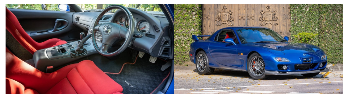
Next up we have a 2002 Mazda RX-7 Spirit R Type A, a model described by Mazda itself as "the ultimate RX-7". One of only 217 finished in Innocent Blue Mica, this 276 horsepower rotary weapon looks absolutely fantastic with those red Recaro bucket seats. Arguably the most beautiful car ever built by Mazda, this rare beast will be one to keep a close eye on at auction.