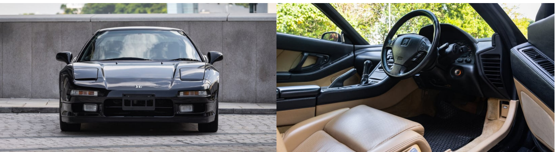
If you're looking for something more mid-engined and less hardcore, then this manual 2001 Honda NSX T will be right up your alley. Finished in Berlina Black with a Tan leather interior, this pre-facelift example looks as good as any of its contemporaries produced by Ferrari, and crucially, with just 35,905 kilometres on the odometer, it should offer plenty of trouble-free miles for its next owner.