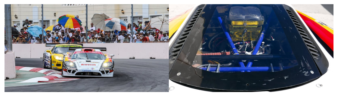
The Saleen S7 is a car that might just jolt your memory back to the early 2000s, and is a machine you might have forgotten about, until now. It was an American car that