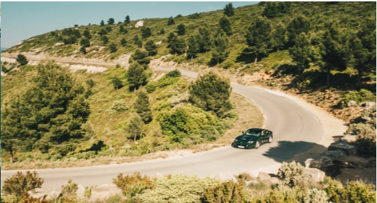
We pull into a little parking area overlooking the turquoise waters of the Mediterranean. The green Ferrari's exhaust ticking away a syncopated rhythm somewhere in the background, cicadas providing a cacophony of deafening chords in around us. As far as creating car-related moments, this one is pretty great in my book. Gallery