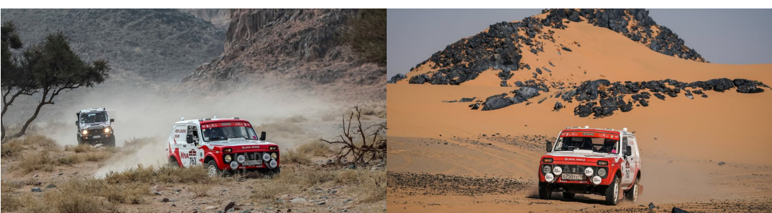
While the team tried to keep the car as standard as possible for reliability reasons, they still reinforced the chassis around the suspension and overhauled the engine, adding an electric fan and electric fuel pump to ensure smooth running. Most of their race prep went into making the car as light as possible, so the hood, doors, and boot lid are fibreglass, while the interior has been totally stripped and fitted with a spec roll cage. Finishing off this endurance machine is a custom 110 litre fuel tank, giving this Niva T1 a mighty range of between 800 and 1,000km. Today, the car remains in almost exactly the same spec as during the 2022 Dakar Classic, except for the addition of new "Vitaloni" mirrors that they added for better visibility.