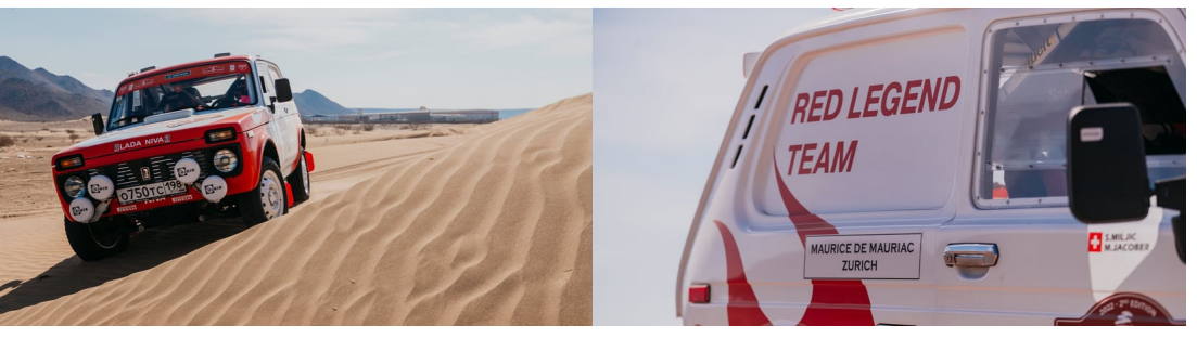
The new owner can expect the car in Dakar Classic-ready condition, along with all the team's spare parts, plus an introductory training course when the car is picked up in Switzerland. If this isn't the perfect way to start your Dakar Classic career, we don't know what is.