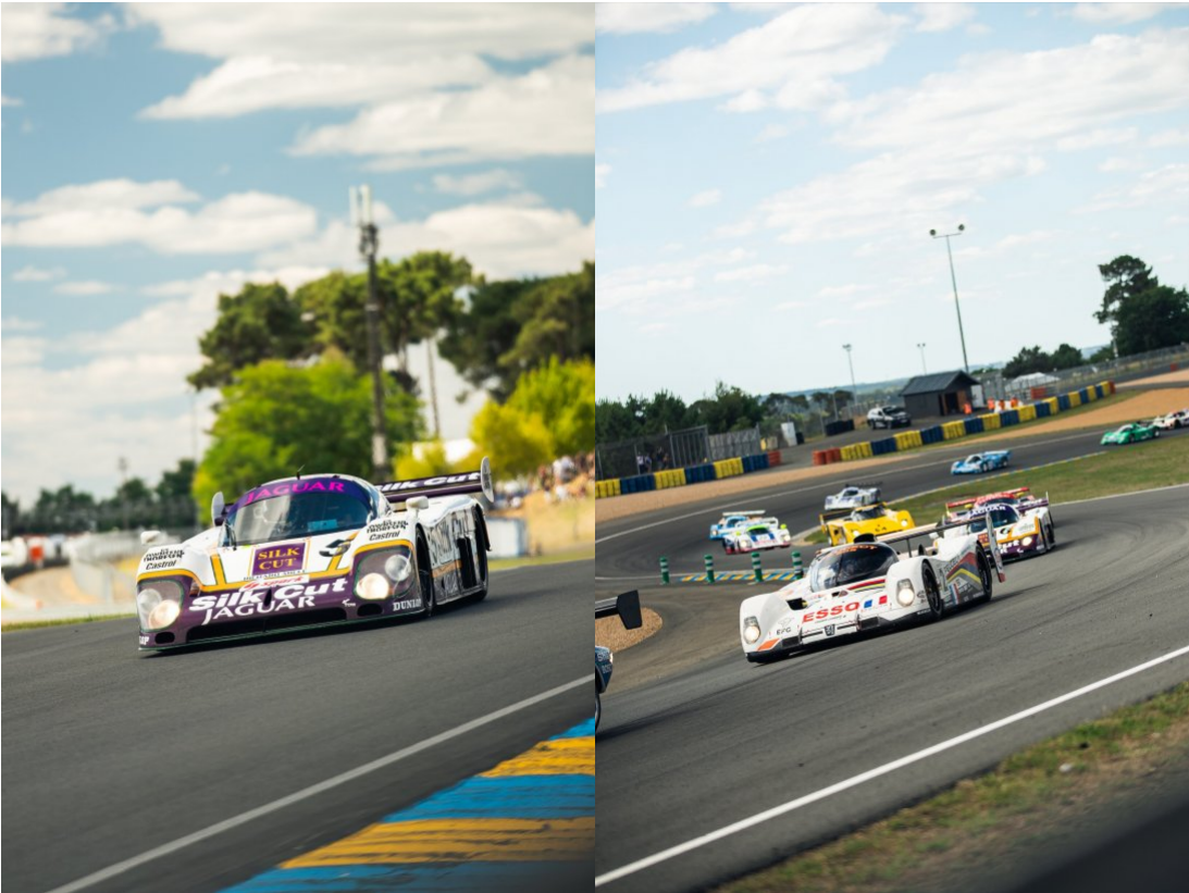
Perhaps just edging out the Dallara in terms of auditory euphoria was the sub-zero Peugeot 905B Evo, which looks just as futuristic today as it did back when it debuted in 1991. Among the other Group C monsters that caught our eye were a plethora of Silk-Cut Jaguars, and who could forget the rotary-powered orange and green flash that is the Renown-liveried Mazda 787B?