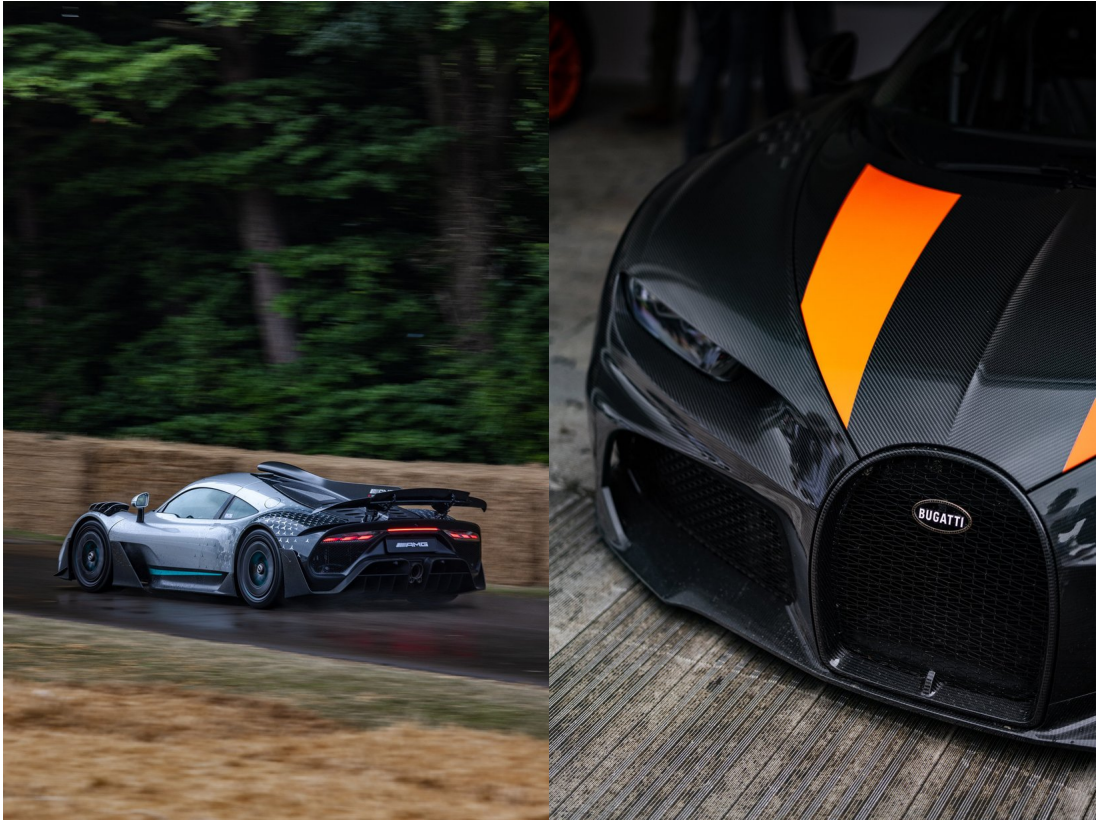
It's hard to ignore the hypercars at FOS, and it seems 2022 has been one of the best yet for releases. Eager fans could catch a glimpse of the Mercedes-AMG Project One for the first time, as well as the Bugatti Chiron Super Sport 300+, Ferrari Daytona SP3 and perhaps the best sounding of all, the ludicrous Pagani Huyara R.