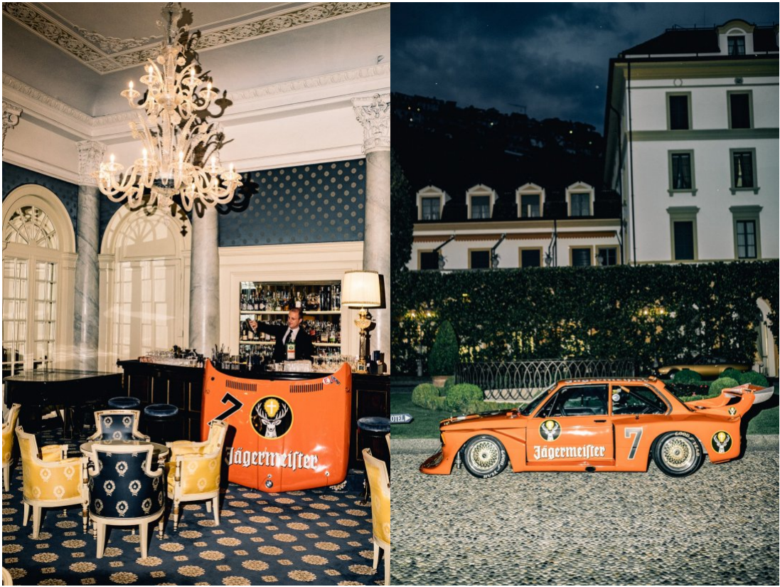
Subsequently restored to concours condition, now it mostly resides in the company's collection, dubbed "72 Stagpower". Taken out from time to time for demonstration runs or as an avatar linking epic driving to to unforgettable nightlife for the @rennmeister72 instagram project, which introduces these iconic cars to a new generation of enthusiasts, the car instantly grabs the attention of anybody that comes into contact with it. We all know that orange cars drive faster. We're keeping our fingers crossed that this one can also win a concours class with its rough, brutalist shape.