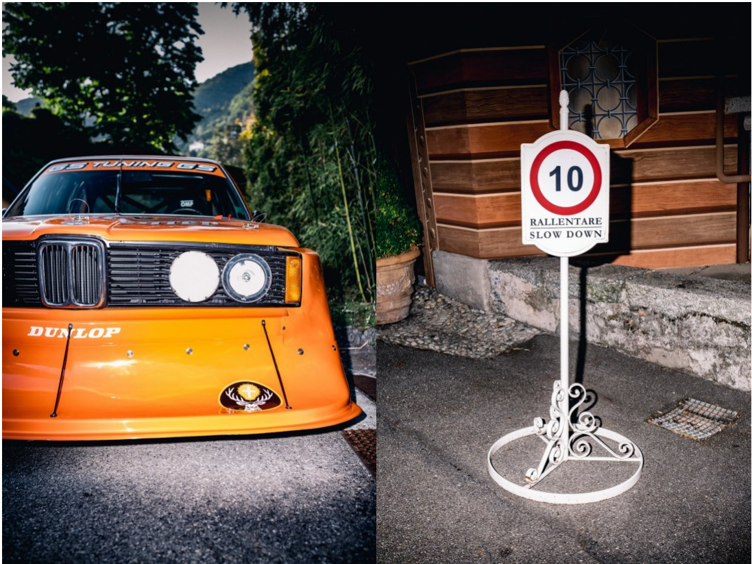
When turbocharging was introduced, power went up even further to 500 hp. It has to be mentioned - as testament of the engine's excellent capabilities - that essentially the same unit later powered BMW's Formula 1 racing cars and delivered more than 1000 hp! The car in competition for this year's Copa d'Oro, and Best of Show Trofeo BMW in Villa d'Este, is a 1978 car and the 29th example built overall, with chassis number E21 R1-29. It was completed for the 1978 season by The GS Freiburg Team - run by Gerhard Schneider - using BMW Works parts, and was driven by Markus Höttinger. Always in the iconic Jägermeister livery. In 1979, it was bought by the Mast-Jägermeister company, and it continued to be looked after by GS and later by Wolber Motorsport.