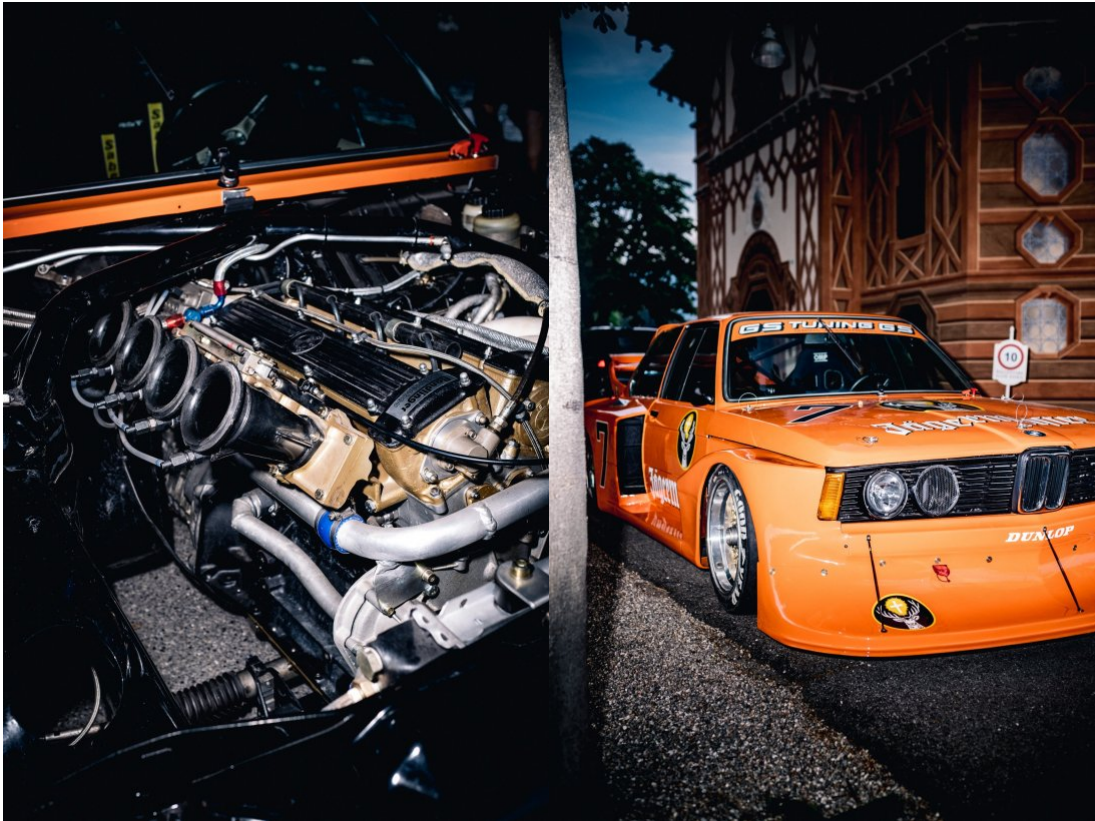
Its many wins can also be traced back to successful outings in the European hill-climb championship. A few examples include Trento Bondone in Italy (1980 and 1982), the Austrian Alps hill-climb prize (1980), Turkheim-Trois Epis in France (1980 and 1981), Ampus Draguignan, also France (1982), Freiburg-Schauinsland, Germany (1982), the Swiss Hill-climb prize in Les Rangiers (1981 and 1982), Bozen-Mendola in Italy (1981), and Copa Sila (1982). The last time it was raced in the DRM was in 1980, at the series finale in Hockenheim, where it finished 6th.