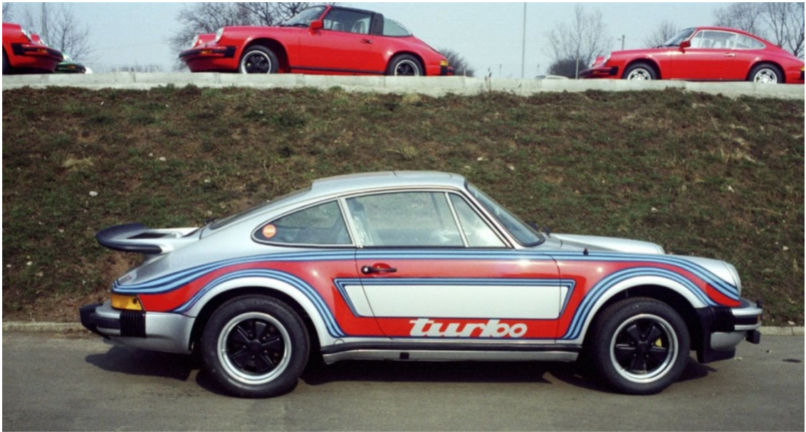
By the mid-1970s, car tuning had turned into a global trend, but what many of the cars boasted in sheer horsepower and style, they were lacking in quality and reliability. In order to meet customer demands for even more special and individual cars at the highest standards of craftsmanship, Porsche bundled up the brand's individualization services under the name "Sonderwunschprogramm" in 1978, offering customizations for new and existing cars. Services ranged from custom-paint finishes to chassis, engine, and body modifications, and individual interiors. Sportscar cockpits were clad with colourful leather and sophisticated HiFi systems with amplifiers and equalizers were installed. At last, Porsche customers had the opportunity to create the car of their dreams.