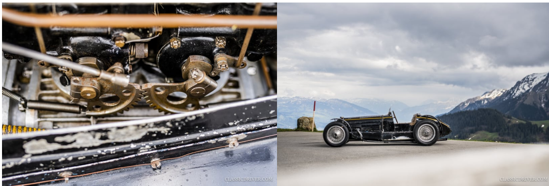
This Type 59 is a former factory Grand Prix car that was campaigned during the 1934-1935 seasons with the 3.3-litre engine number 5. René Dreyfus drove it to an outright win at the Belgian Grand Prix at Spa and also finished third that year at the Monaco Grand Prix. At the end of the season, facing stiff competition and struggling with poor finance, and despite the performance of their eight-cylinder compressor-engined Type 59s, Ettore Bugatti decided not to enter Grand Prix races any more. While four of the Type 59s were sold to English enthusiasts, the very first one was kept by Bugatti and converted into a sports car. In this process, Bugatti removed its supercharger and created a new body with motorbike wings, a single aero-screen, small headlights, side doors, and so on. He also fitted the car with a new remote oil tank, offering twin-pump lubrication, and a new four-speed dry-sump all-synchrom gearbox with a central change.