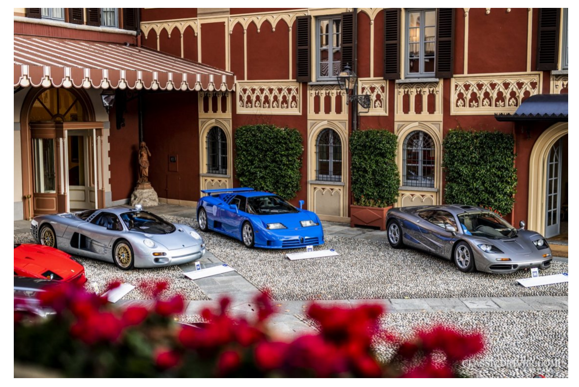
The highlight of each Concorso d'Eleganza Villa d'Este is the parade of all competing cars on the Grand Hotel's trademark terrace on Saturday. On Sunday – and this is one of the major changes compared to previous years – the top-placed cars will return to Villa d'Este together with the concept cars and prototypes for a second parade as well as the prize giving by the jury. The winner of the "BMW Group Trophy – Best of Show" and concours watch – a one-of-a-kind A. Lange & Söhne 1815 Chronograph – will be announced during Sunday afternoon. A limited amount of entry tickets is available online for both days.

Slightly younger, but equally impactful are the mean machines that were produced under the banner of BMW M in the last 50 years. While there will be a dedicated concours class for BMW M cars and their ancestors, BMW will also reveal the eagerly awaited M4 CSL – and isn't the carefully raked gravel of the Grand Hotel's lakeside estate just begging for some freshly painted donuts? By the way, BMW M shares its <u>birth year of 1972 with Jägermeister Racing</u>, and we wouldn't be surprised if <u>our friends from</u> <u>Rennmeister</u> had a small cameo in mind for this year's Concorso d'Eleganza. There are of course plenty more exciting themes and concours classes scheduled for this year's Villa d'Este weekend. Expect elegant art déco automobiles, an armada of supercharged Mercedes-Benz Kompressor cars, a selection of exceptional track toys from the golden days of motor racing, and plote to spot some of the latest concept cars, one-offs and hyper cars: BMW has already teased that the brand-new, all-electric i7 will be on show, as well as a second Rolls-Royce Boat Tail.