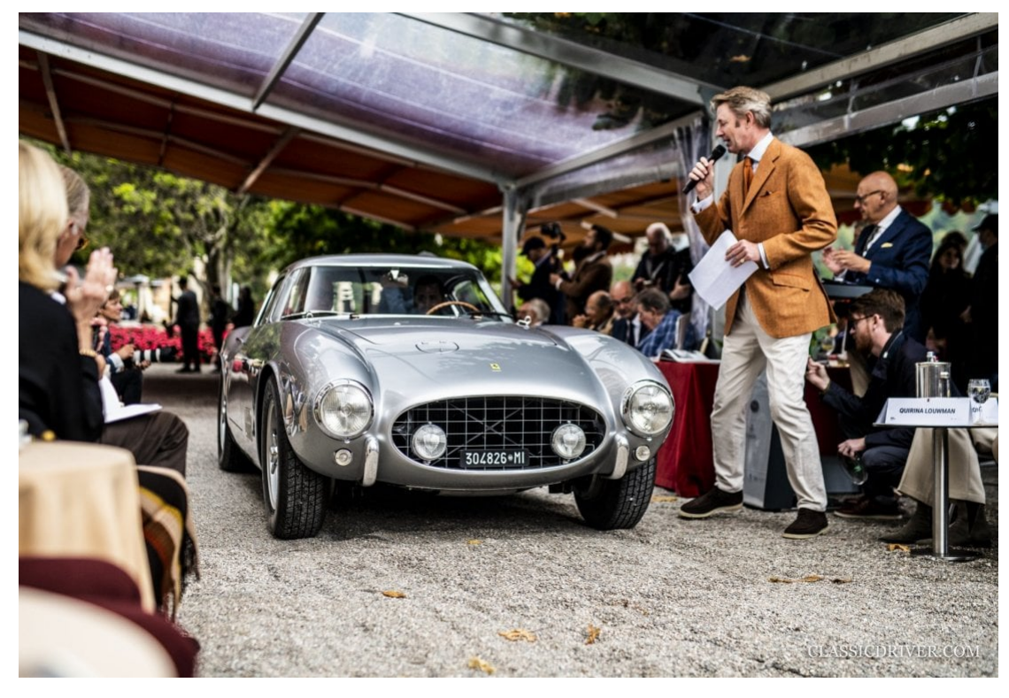
Then, of course, there is the 75<sup>th</sup> birthday of Ferrari to be commemorated. After <u>a mind-boggingly beautiful Ferrari 250 GT Tour de France</u> won last year's concours, the selecting committee had the tough job of choosing eight iconic cars from Ferrari's overwhelming back catalogue, one for each decade of the brand's history. Classic Driver readers who have paid close attention in the last weeks <u>will know at least one</u> of the eight exceptional cavalli guaranteed to stun the crowds at this year's concorso.

r once, the people at BMW Group Classic and Grand Hotel Villa d'Este – who have jointly held the Concorso d'Eleganza for more than 20 years – have slightly shaken up the nedule and will kick off the concours weekend on Thursday with a sneak preview of some of the cars in and around Milan and a prelude tour to Cernobbio. Saturday, however, is II the big day at the Concorso d'Eleganza Villa d'Este: more than 50 cars will compete in seven classes for the public vote and the 'Best of Show' trophy awarded by the jury, the sfeo BMW Group. Considering the amount of anniversaries to be celebrated at this year's event, guests should be ready for a big birthday bash. First of all, there is the Grand 'tel Villa d'Este itself that is celebrating its 150<sup>th</sup> anniversary with a special class for cars that 'once made a grand entrance' – vehicles that have gone down in the annals of the nocurs as winners of the Coppa d'Oro Villa d'Este or the "Best of Show" trophy since the first event took place in 1929.