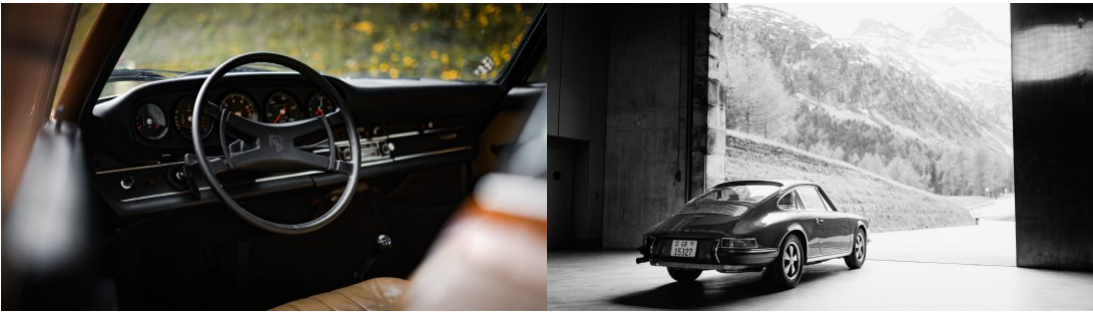
In addition to the Porsche 917, Siffert had also transported a fleet of Porsche 911s and 914s to Le Mans, which were enthusiastically used by director John Sturges, Derek Bell, and other members of the film crew – both as fast shuttles from one location to the next, but also during impromptu post-shoot races, mostly initiated by Steve McQueen. The most famous 911 from the fleet is certainly the slate-grey Porsche 911S from the opening scene of the film, which the “King of Cool” later took with him to his American homeland. In 2011, McQueen’s movie car was auctioned off for $1.375 million.