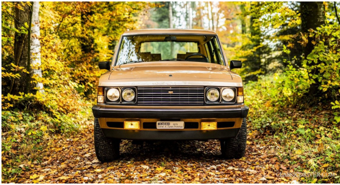
The Monteverdi Safari was a mythical SUV beast made in Switzerland. We took it's prototype to the woods.