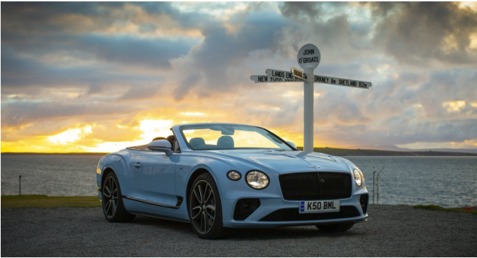
And we raced the sun across Britain in a Bentley on the longest day of the year.