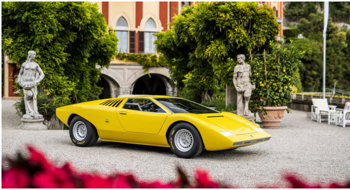
Crashed decades ago, the game-changing Lamborghini Countach LP 500 returned.