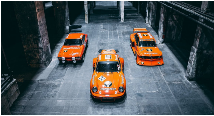
The new Rennmeister brand created by Jägermeister and Classic Driver came to life, shining a new light on the iconic orange racing cars.