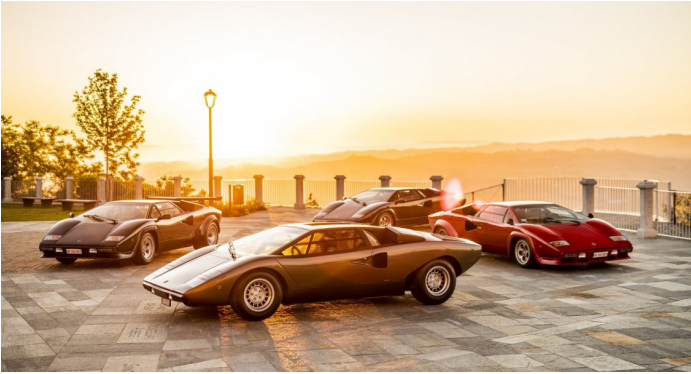
In Piedmont we celebrated the 50th anniversary of the Lamborghini Countach - the supercar that fell to Earth .