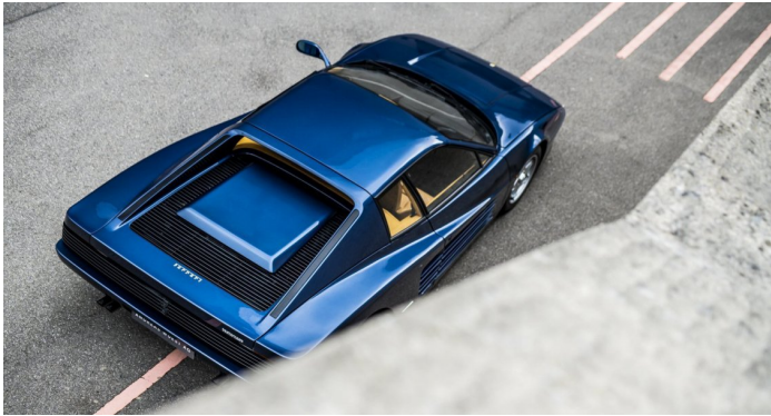
Back at home in Switzerland, we fell in love with a blue 'Monospecchio' Ferrari Testarossa .