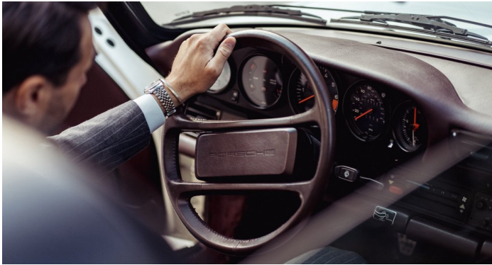
Only to hit the road again and take a sprint through Warsaw with the world's fastest tailor .