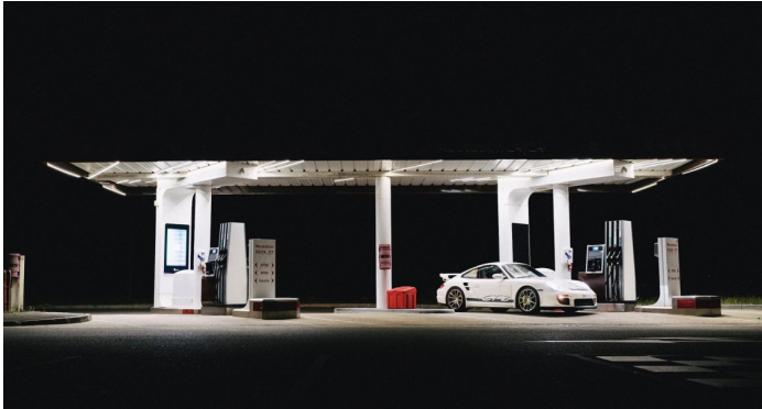
With the help of TAG Heuer, we chased the last train to Le Mans in a Porsche 911 GT2 .