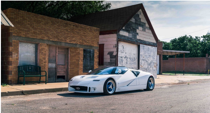
Following our Need for Speed II nostalgia, we traced Ford's visionary GT90 concept in Oklahoma.