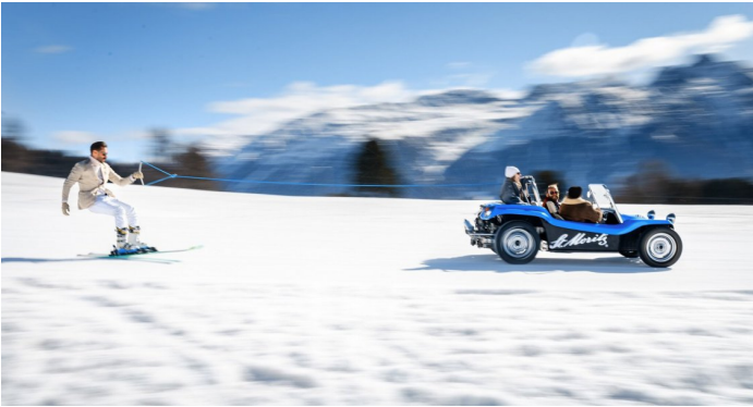
We went skiing with Meyers Manx in St. Moritz .