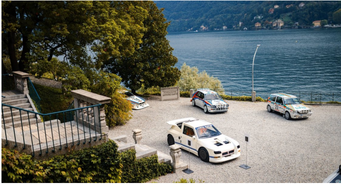
Meanwhile at Fuori Concorso , turbo whistles were in the air.