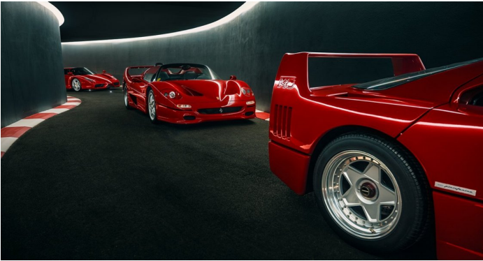
This top-secret Ferrari bunker has its own racetrack - and we almost didn't believe what we saw.