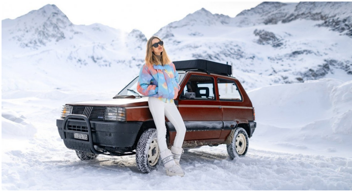
Snowtime was showtime with this 1980s-inspired Superpanda .