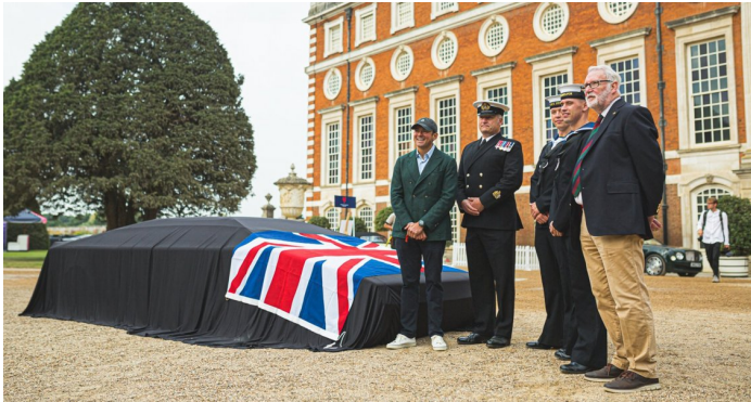
We went to the Concours of Elegance and watched the Aston Martin Bulldog return .