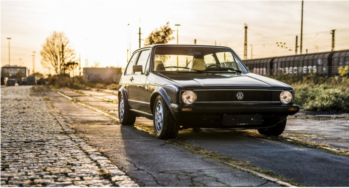
This modest VW Golf turned out to be a Porsche 928 in disguise.