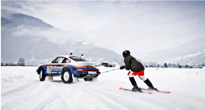
We cold-started into the new racing season with the GP Ice Race crew.