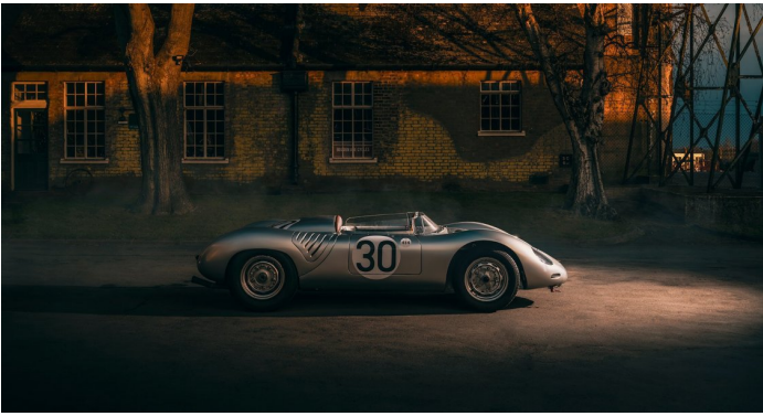
At Bicester Heritage, we had a rendezvous with a stunning 1958 Porsche 718 RSK .