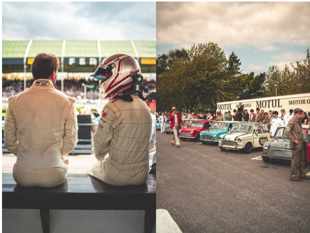
Further down the field the action continued with amazing saves and slides in the Minis, rule of thumb is to always keep your foot planted on the throttle and for Le Mans legend Roman Dumas it paid off as he passed Neal to take second place in the closing stages of the race. Would we like the Minis back for 2022? Oh yes! But, can we have go?