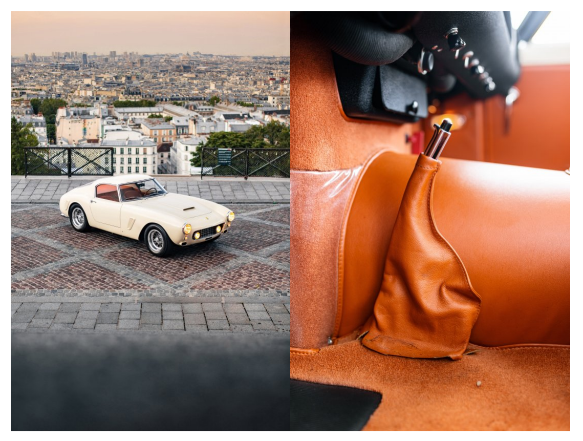
The 1962 Ferrari 250 GT Berlinetta SWB Continuation offered for sale by Aguttes is pretty special. It's a very accurate recreation of one of the 75 aluminium-bodied 250 GT Berlinetta SWB Competiziones. The best artisans around Modena patiently crafted the car for a renowned Ferrari expert, who then sold it to a gentleman driver who's maintained it at the highest level. The cherry on the cake is that Peter Auto has officially confirmed this special car is eligible to take part in Tour Auto and the Greatest Trophy series, racing on tracks.