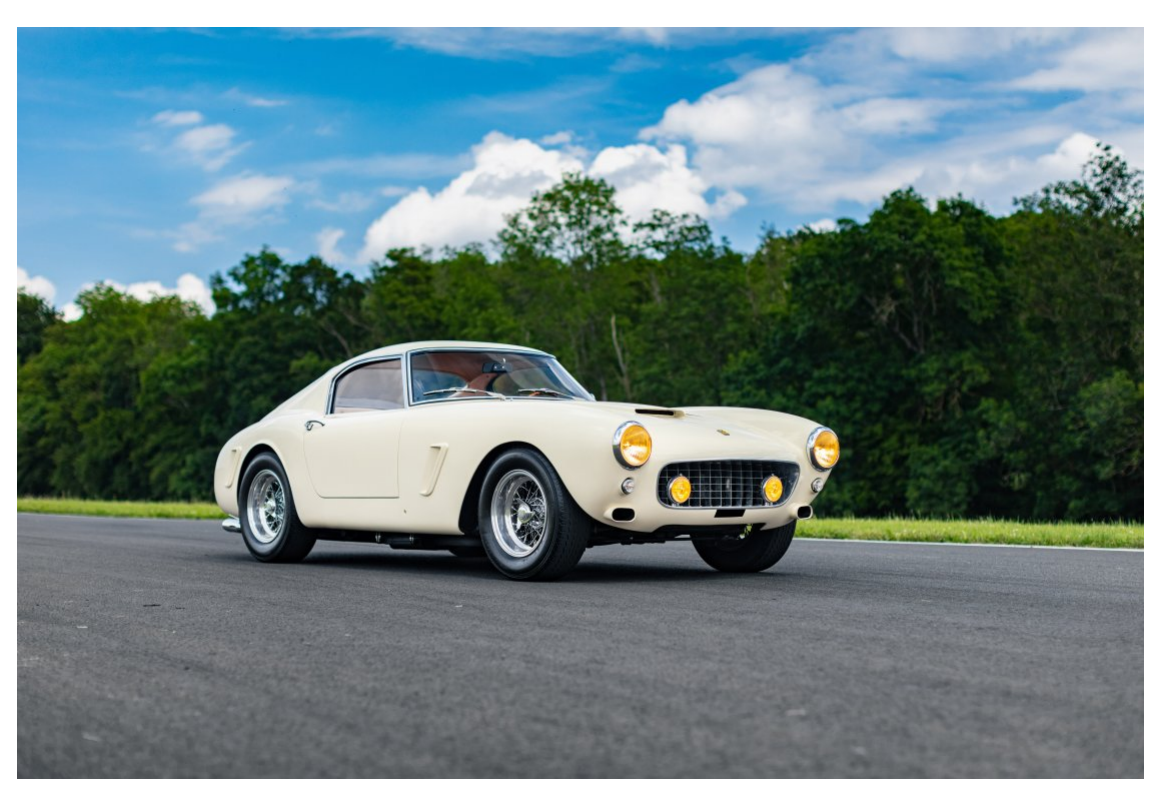
As for the 250SWB, this year's Tour Auto promises to be memorable, since the rally will celebrate the legendary model, and eight are expected to take part. Half of them will be genuine cars, the other half will be described as 'continuation' cars, as the organisers have decided to soften the eligibility rules, allowing cars that are based on a Ferrari 250 chassis and built to the same standards as the original examples.