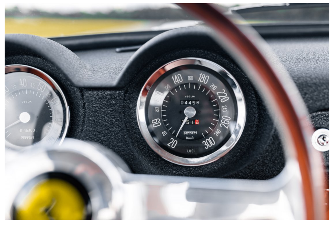
Carefully maintained by its current owner, a gentleman driver who has mostly taken it out for Sunday drives and leisure rallies, the car has just been fully overhauled by Ferrari Pozzi in Levallois-Perret. The decision was made by the perfectionist owner to have Pozzi rebuild the upper part of the engine – an invoice totaling over €22,000. Registered in the UK, the car will be offered for sale on 30 August at the Grand Palais Ephèmère in Paris with a €750,000 to €950,000 estimate. Needless to say, the temptation will be high for the lucky new owner to take part in the rally along with the eight other 250SWBs expected at the starting line.