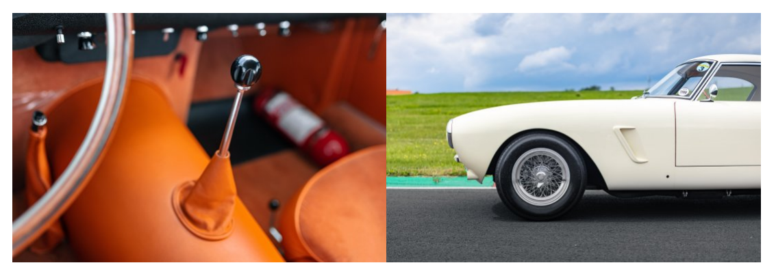
Today's Tour Auto is slightly more civilised, but it's still a challenging five-day rally mixing special stages on closed French public roads with track sessions on various circuits. The 250SWB has always been at home on Tour Auto, both the Lusso steel-bodied version mostly seen in the regularity class and the aluminium-body racing version seen in competition class. And as Tour Auto has made the Grand Palais its starting point of choice in recent years, seeing numerous 250SWBs back in the place where the car was unveiled has always been a treat for the eyes.