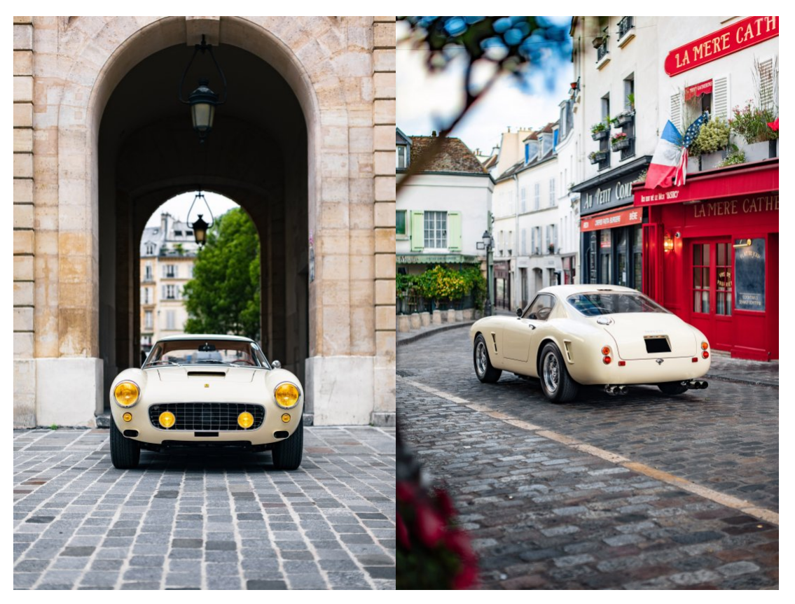
Rossignol has had the privilege of driving the car and the experience did not disappoint: "We drove on the twisting Circuit des Ecuyers track and I was amazed: it literally turns flat, only crashing very lightly on the outer suspension, which offers a great driving feeling. The brakes are really good, too; the gearbox is very precise and firm and I had memorable driving sensations with the V12 screaming once you go over 5,000rpm before plunging into another corner. You just can't get enough of it!"