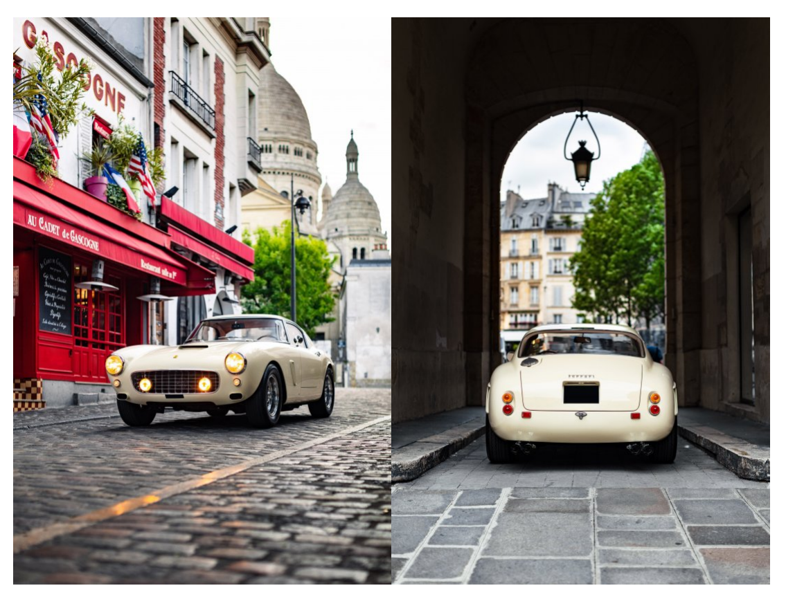
It's true that the names of the workshops involved will be familiar to historic Ferrari owners. This car is based on a 1962 250 GTE with the chassis number 3369GT, delivered new in Rome, as the chassis, engine, axle and running gear of these two models are very similar. Over a period of three years between 2013 and 2016, the chassis was brought up to racing standards (2.41-metre wheelbase) by the renowned specialist Reggiani near Modena. The aluminium bodywork was carried out by the Bacchelli & Villa workshop, also known as Carrozzeria Autosport, in Bastiglia, who confirmed this car will be their last continuation, since they now only do restorations. The engine passed into the expert hands of Toni Auto, the famous workshop based in Maranello. The car is accurate down to the smallest details, such as the magnesium carburetors and the drive of the fuel pump by the left camshaft.