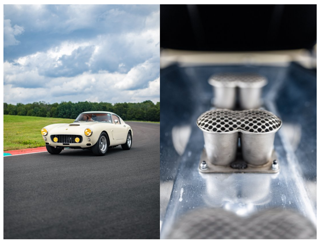
This year will be no exception, apart from a few changes: firstly, like last year, Tour Auto will happen in the first week of September, not in April. And, for the first time in quite a while, it won't start from the Grand Palais (which has been closed for an ambitious renovation program), but from the Grand Palais Ephémère, a sleek, contemporary-looking temporary structure designed by Wilmotte and Associates, built on the Champs de Mars next to the Eiffel Tower.