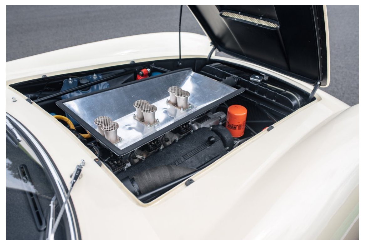
As Rossignol tells us: "the proportions, the alignments... the result is amazing. The quality of the paint is also outstanding and the Avorio beige color truly stands out when you see the car in the flesh. The interior has a very special atmosphere with its long gearlever, the controls on the dashboard and the orange-brown upholstery redone in Maranello by Luppi." A few reversible changes have been made, such as the rebuilt gearbox converted to five speeds by GTO Engineering in the UK, the smaller steering wheel to ease the access on board and the cigar lighter plug on the left of the steering wheel.