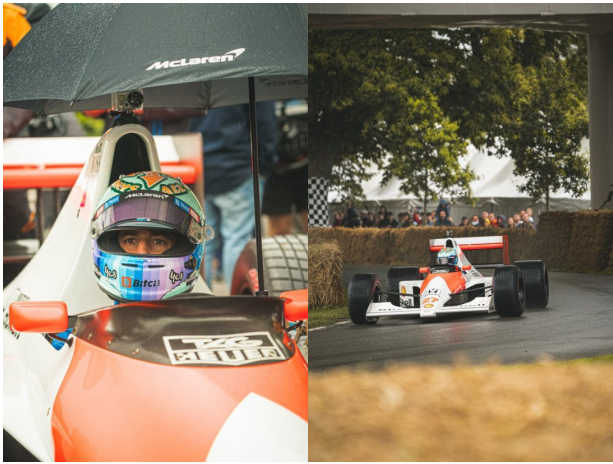
How do you brighten up a dull day? Stick Daniel Ricciardo in one of Ayrton Senna's old McLaren Formula 1 cars. We are guessing Ricciardo is deep in thought as to if he should attempt one of his legendary 'shoeey' moments when he gets to the top of the Goodwood Hill. We say yes!