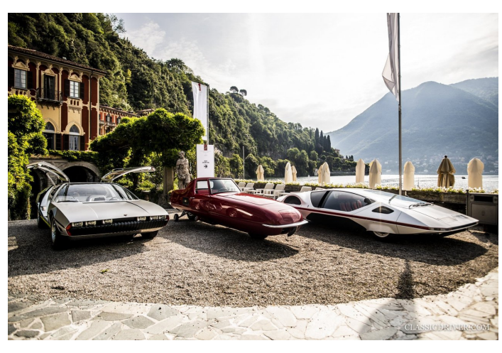
The thought of sipping an Aperol spritz on the shores of Lake Como in October, enjoying the last of the warm autumn sunshine, is dreamy. On 16-18 October, the rescheduled Concorso d'Eleganza Villa d'Este will take place, and you can make that dream a reality. Better still, the third Fuoriconcorso, the theme for which is yet to be revealed, is poised for the same weekend.