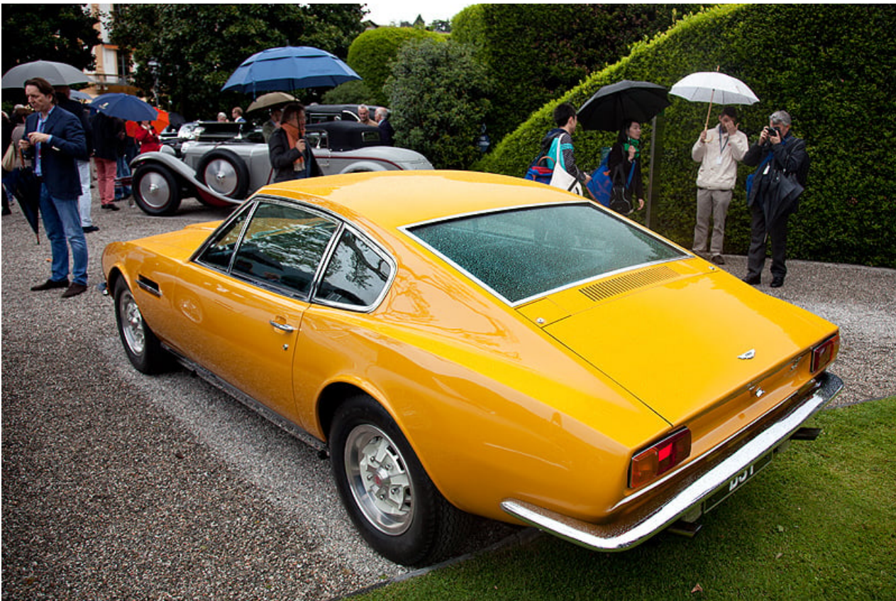
As the original ‘Bahama Yellow’ steed of Lord Brett Sinclair (Roger Moore) in ‘The Persuaders!’, this DBS kindled much debate within the Classic Driver team, with some believing it worthy of first place. Rarely has a six-cylinder DBS been so perfectly presented – note the retention of V8-style wheels, true to its appearances in the 70s TV series.