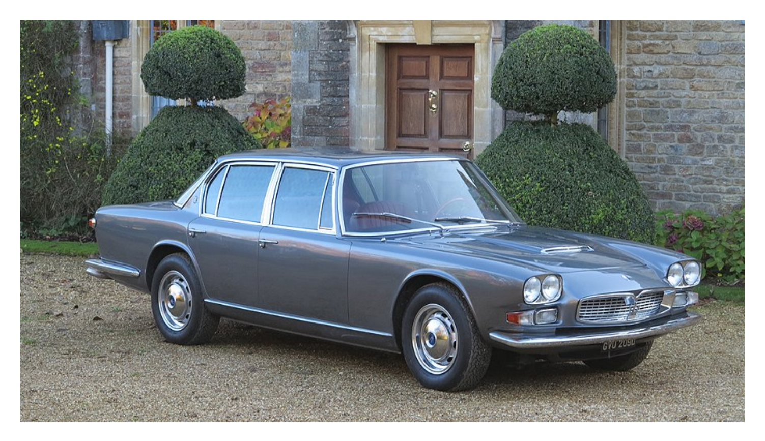
Coys' 4 December 'True Greats' auction will be held at the Lindley Hall of the Royal Horticultural Society, Vincent Square, London SW1P 2QW. Automobilia will start at 13:00, motor cars at 19:00 prompt.