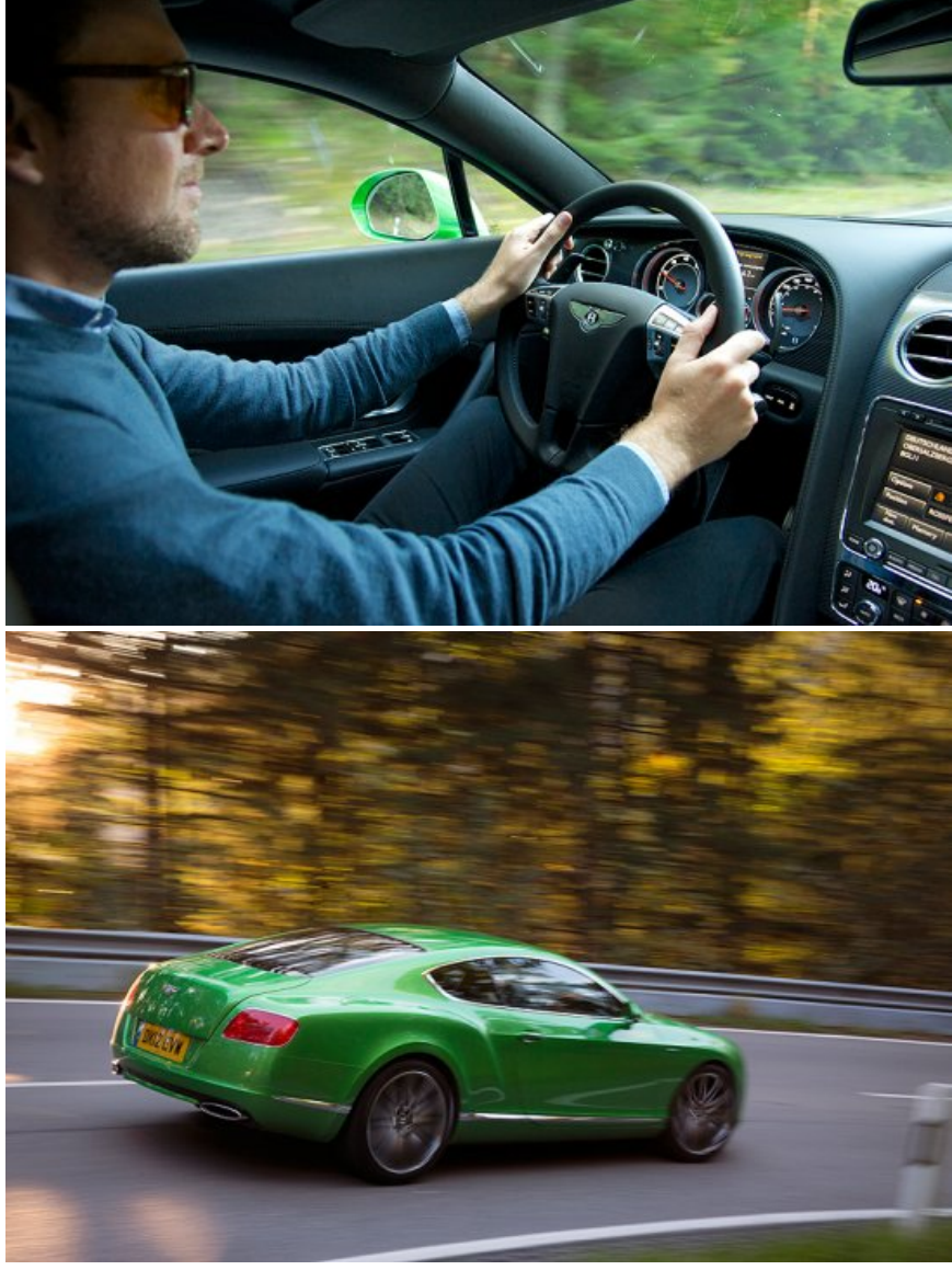
And the figures don't stop there. With 4,000 litres of air per second swallowed by the front radiator, and the rear spoiler - when extended - generating downforce of 125 \, \text{kg} , the car redefines the term 'making the