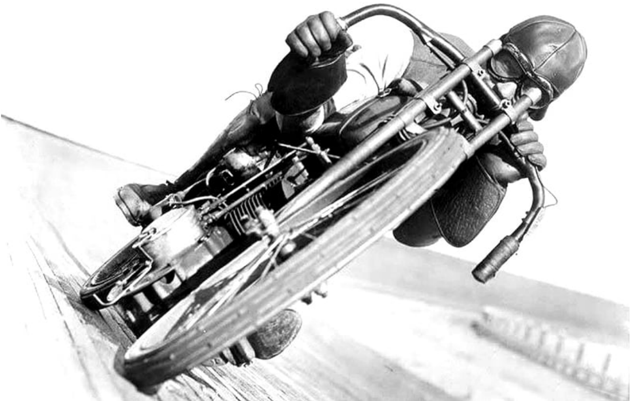
Van Anz has now revived the minimalist board track look with his on-trend Derringer Cycles company, which combines vintage aesthetics with modern, high-efficiency 50cc petrol engines. The result is a truly eye-catching steed that's also remarkably practical as a cross-town commuter bike. Top speed is around 40mph but, with a featherlight touch on the throttle, a gallon of fuel can be made to stretch as far as 180 miles.