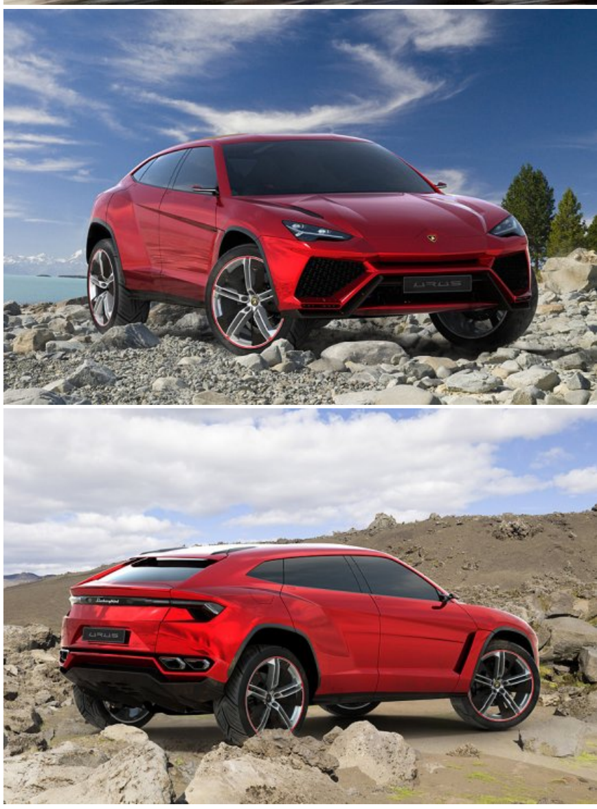
Of course, this isn't Lamborghini's first foray off-road. The late Eighties saw the limited production of the tank-