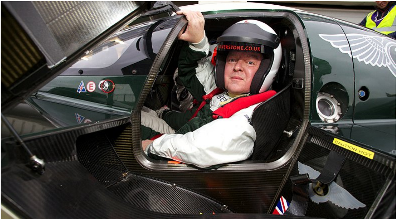
It's claustrophobic in here, and loud. Into first gear in the sequential transmission, and off we surge and fluff down the pitlane. Now out on the track, Smith applies full noise and the Speed 8 hurtles away as though