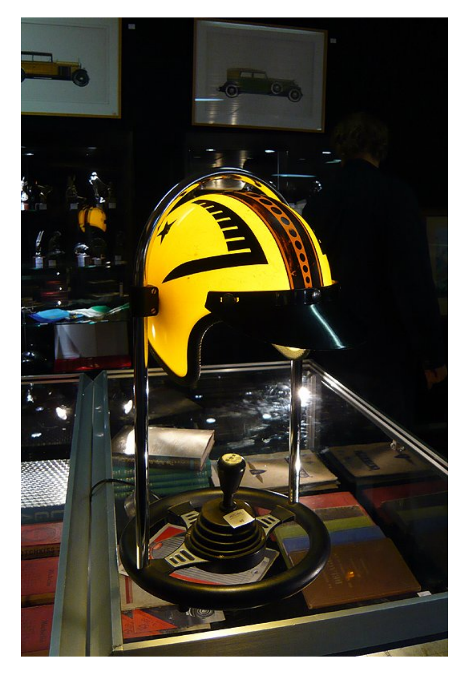
For 2012, Artcurial Motorcars has an ambitious programme which includes sales at Rétromobile, Paris on Friday, 3 February and at the Le Mans Classic, on Friday 6 July. Early entries to the Paris sale include an amazing (and huge) 1913 Delaunay Belleville (400,000 – 500, 000 euros), while the Le Mans sale will include an ex-factory Peugeot 905 EV13 sold Sans Réserve (estimate 700,000 – 1,200, 000 euros).

1955 Mercedes-Benz 300 SL 'Gullwing', sold for 531,378 euros