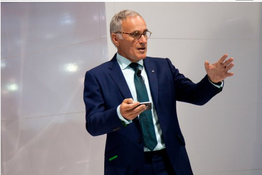
Mercedes-Benz and Smart