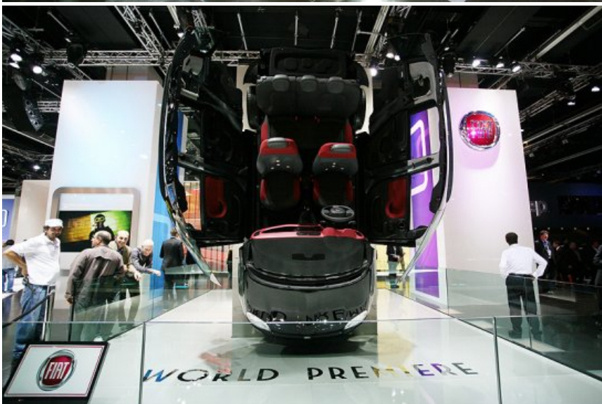
Text: Steve Wakefield