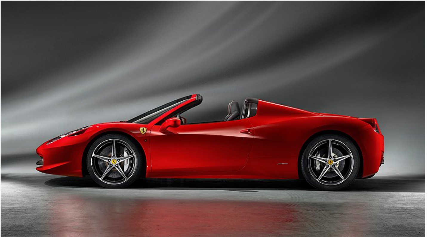
figure is a cheerfully brisk 3.4 seconds, with a top speed of 320km/h, and a weight of 1430kg that's just 50kg more than its closed-top cousin.

Even the fuel consumption seems – miraculously – to have fallen, with CO2 emissions dropping to 275g/km. Not exactly eco-warrior territory, perhaps, but pretty impressive for a car with this outrageous performance. Full details, including pricing, will be announced at the IAA in Frankfurt in September, precisely two years after the world premiere of the Ferrari 458 Italia.