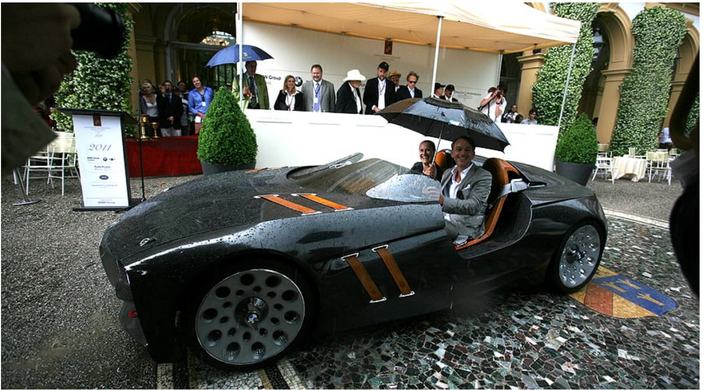
As it was 75 years since the BMW 328 was announced, the Bavarian company celebrated the fact in style with the 328 'Homage'. This was displayed alongside the other modern concepts but, naturally enough, was not eligible for the silverware.