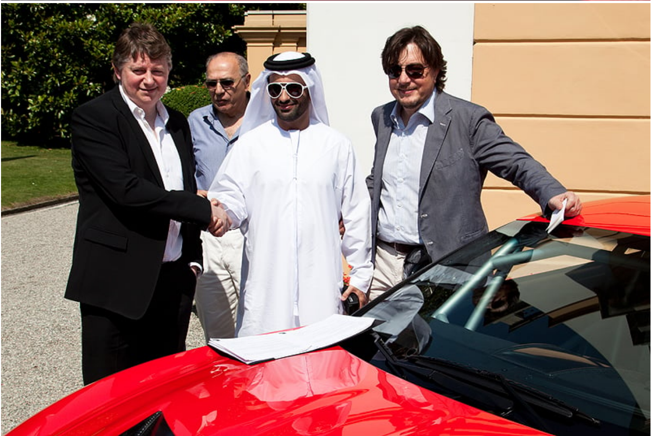
The concept class was won, quite deservedly in most people's opinion, by Aston Martin's latest collaboration with the great Milanese styling house Zagato.