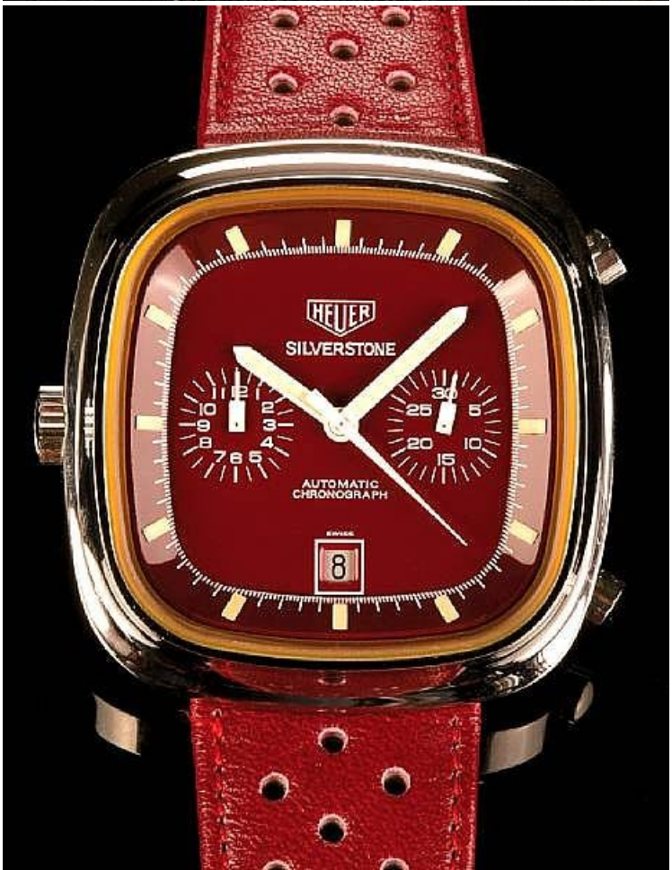
Left: 1972 Montreal Ref. 110503 B, £2500 - 3500; Centre: 1967 Autavia Ref. 7763 MH, £2000 - 2500; Right: 1974 Silverstone Ref. 110313 R, £4000 - 6000