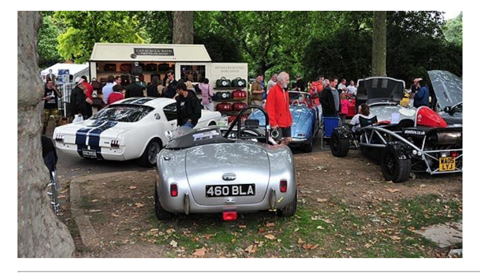
ClassicInside - The Classic Driver Newsletter Free Subscription! Gallery

Text: Steve Wakefield