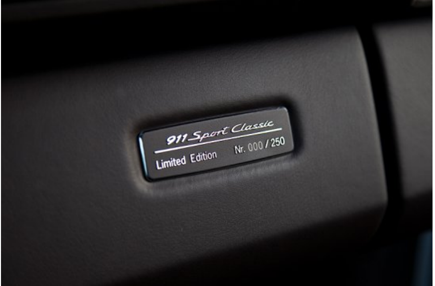
The 1973 Carrera 2.7 RS was an exceptional sportscar and, based as it is on the Carrera S , so is the Sport Classic . The 3.8-litre flat-six engine, with direct injection, has been tuned for resonance with six switching flaps in the manifolds, raising the maximum output by 23PS to 408PS. Accompanied by a pronounced 911 roar, the Sport Classic sprints from 0 to 62mph in 4.6 seconds. Top speed is 188mph. In honour of the original, Porsche resisted the temptation to fit the PDK double-clutch system here. All Sport Classics will come with a manual six-speed gearbox. The enhanced PASM chassis keeps the Sport Classic level on the road, and carbon-reinforced ceramic brakes supply the necessary stopping power.