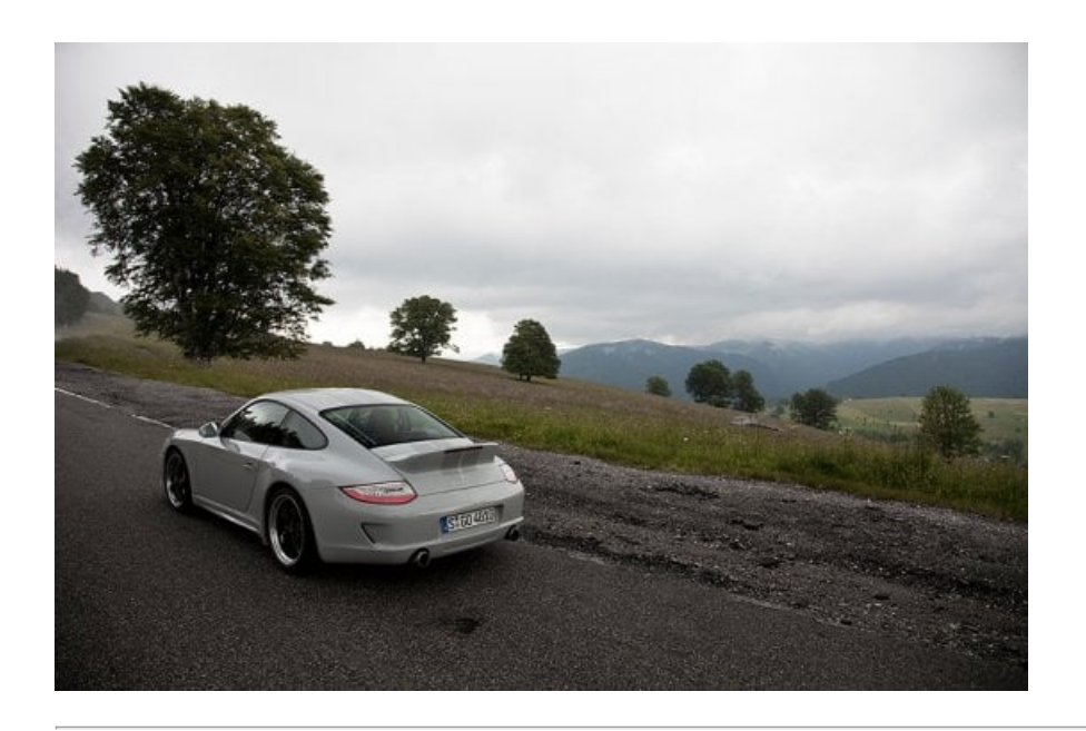
ClassicInside - The Classic Driver Newsletter <u>Free Subscription!</u> Gallery