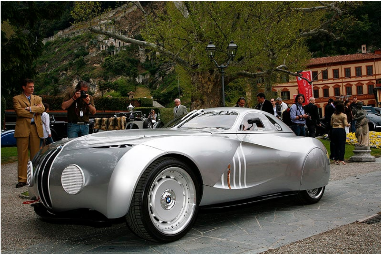
Text: Classic Driver Photos: Gudrun Muschalla