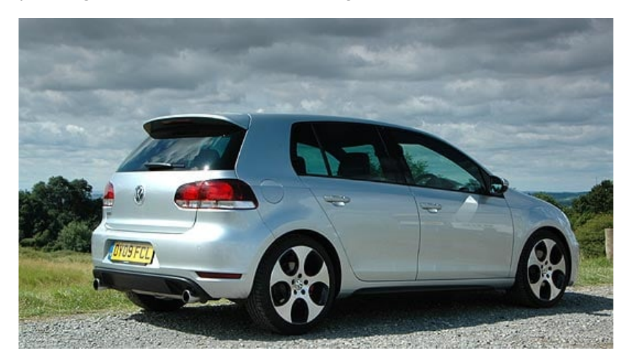
It is a brilliantly practical package.

True to form, VW has kept the GTi's additional styling simple and classy: just a rear spoiler, a new front bumper below the famous 'red line' grille, subtly modified side skirts and a twin exhaust-pipe treatment framing a revised rear diffuser. The tartan fabric is still standard – although our car was trimmed in the optional 'Vienna' black leather, a £1675 extra that also includes heating and electric adjustment – and the front sports seats are as perfect for long journeys as they are for seat-of-your-pants cornering. Rear-seat passengers will like both the extra legroom and headroom afforded by the latest bodyshell.