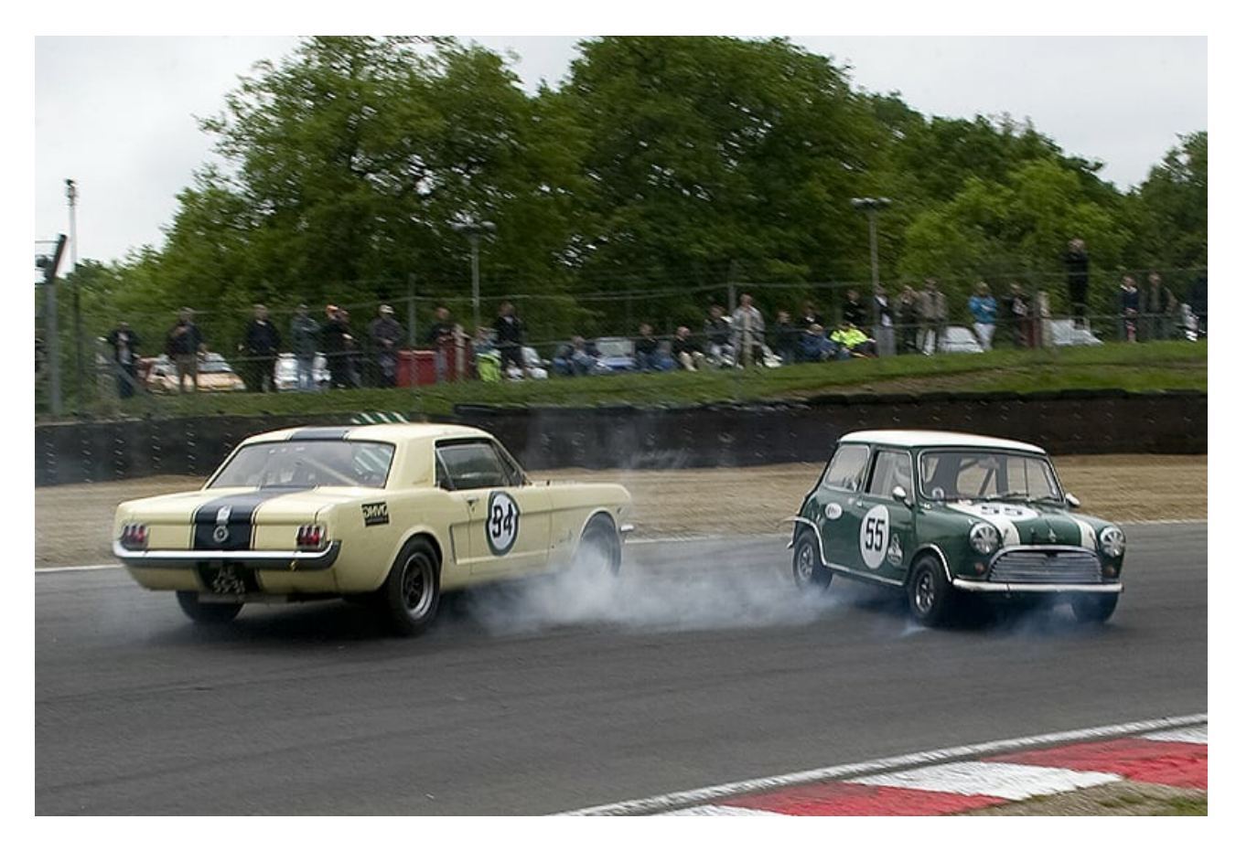
On Sunday and Monday the meeting expanded onto the full Brands Hatch Grand Prix circuit. Many 'Historic' meetings are held at tracks with names that go back into the history of motor racing, but it has to be said that most of these have been modernised out of all recognition; not so with Brands.