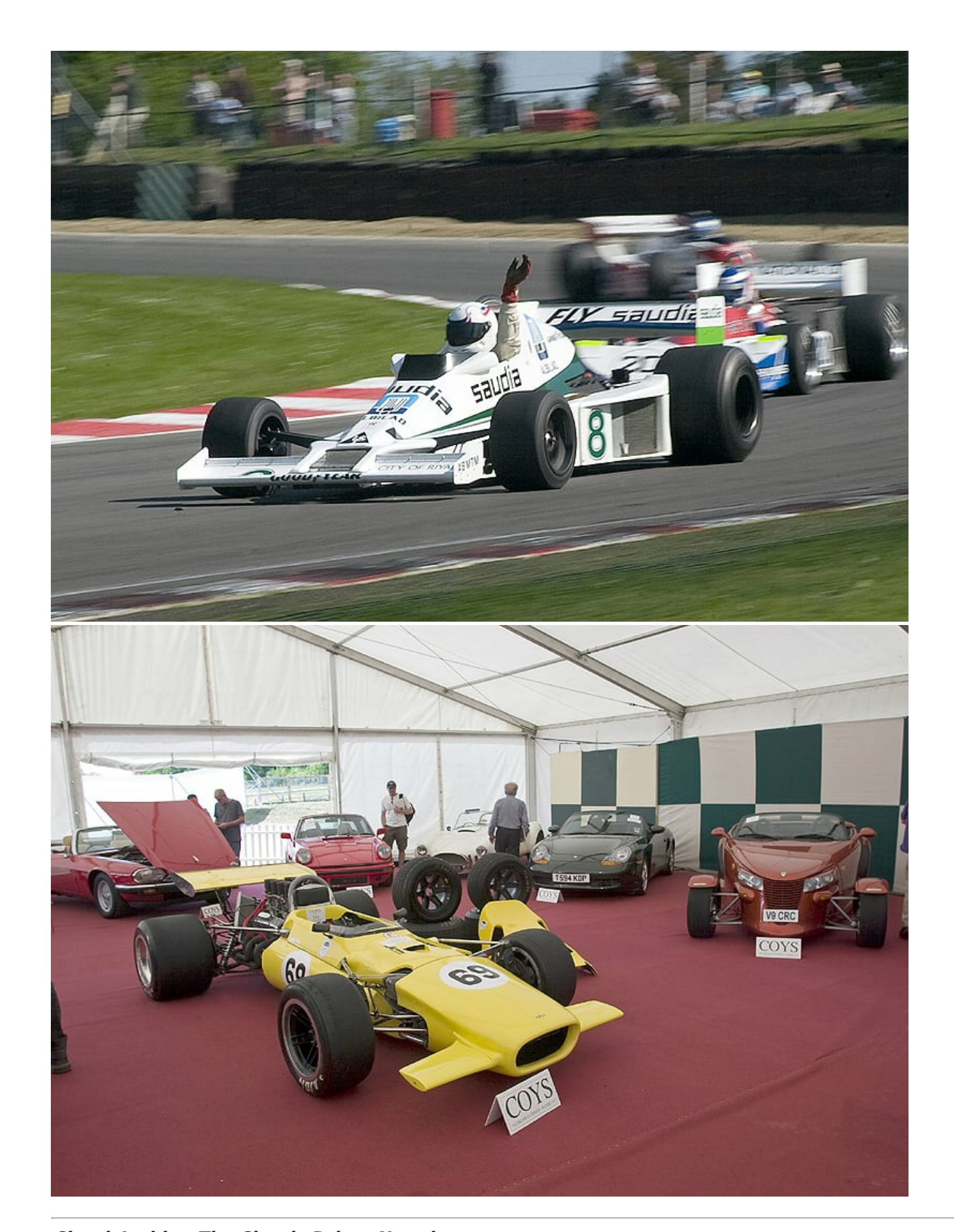
ClassicInside - The Classic Driver Newsletter Free Subscription! Gallery