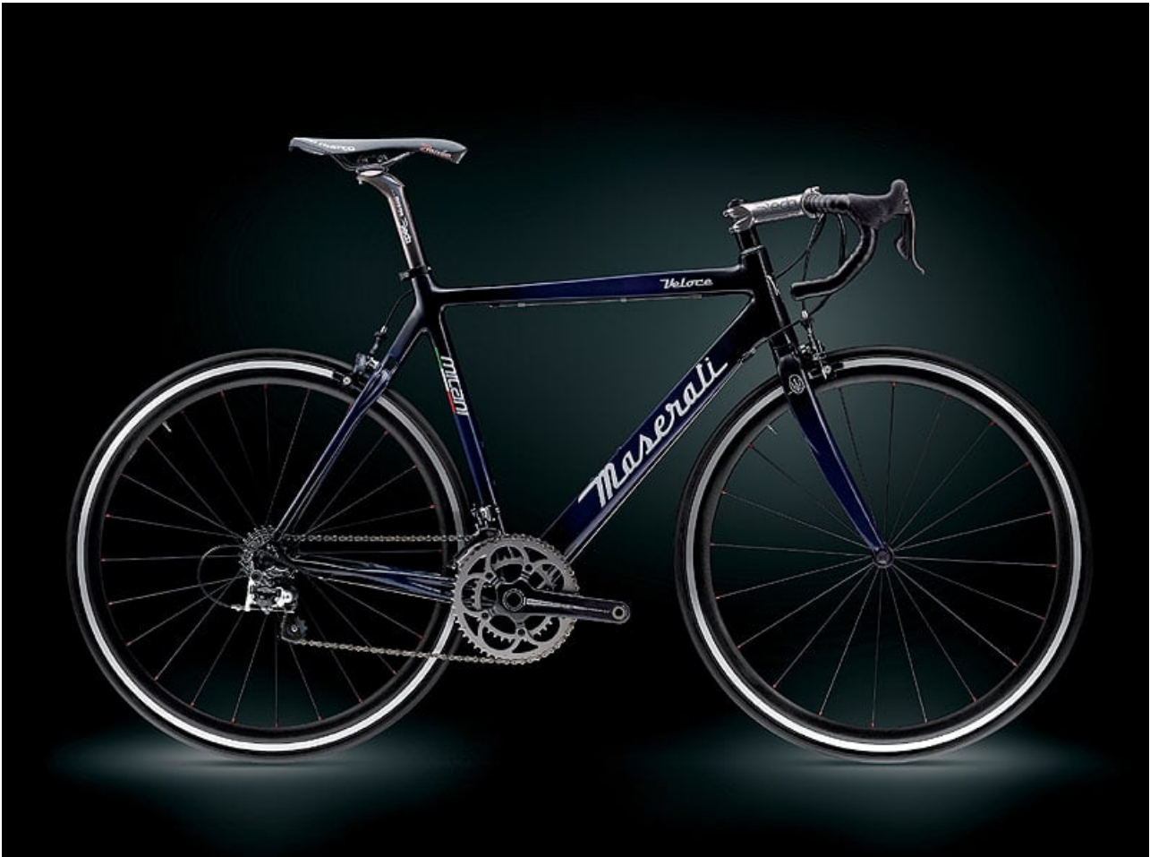
Buyers can choose from two designs: the ' Veloce ' is a high-performance racing machine – an ' MC12 ', if you like – while the ' Turismo ' is suited to more gentle pursuits, such as touring or city commuting.

Both versions are available in five sizes (s, m, I, xI, xxI). Prices vary between 3000 and 6000 euros -