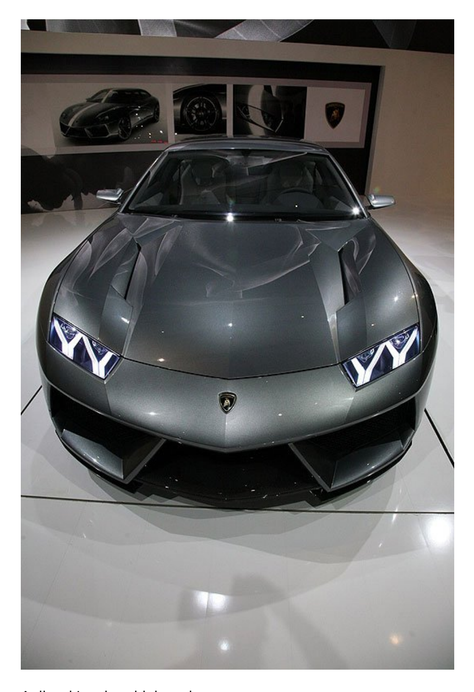
A diesel Lamborghini, gosh.

The styling is unmistakeably from Sant'Agata Bolognese, though, with sharp creases, boxy air-intakes and large areas of only gently curving glass or steel. To this writer's eyes it looks superb; maybe a little staid in comparison to the two-seaters, but powerful and elegant. It has four single seats and - at 5.15m long - is a big car, longer than a Continental GT and only just a little shorter than a Flying Spur. It's wide, too, at 1.99m, yet is only 1.35m high.