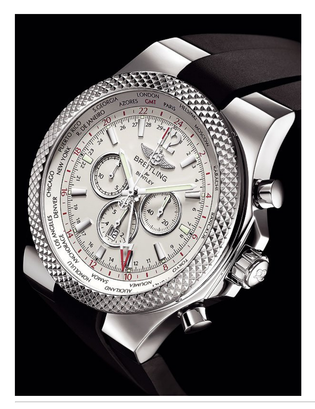
Breitling for Bentley GMT Chronograph