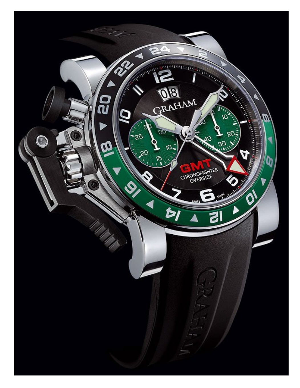
Chronofighter Oversize GMT Big Date BRG