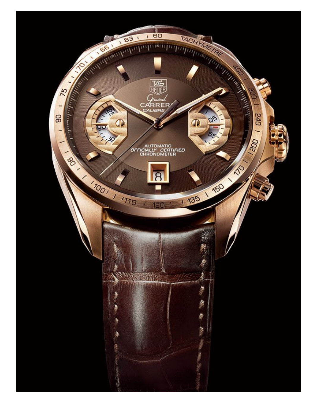
Carrera Chronograph Calibre 17 RS Roségold