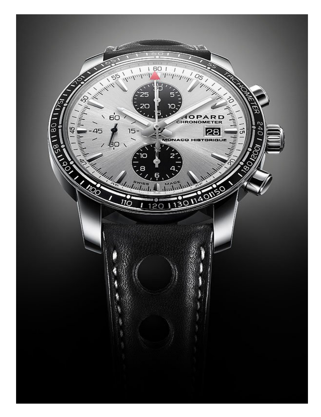
Chronograph Grand Prix de Monaco Historique 2008