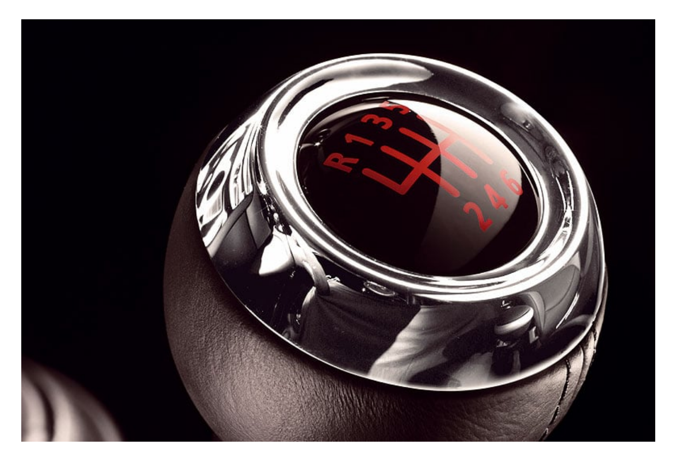
The John Cooper Works suspension lowers the entire car by 10mm, while extra-large disc brakes, adorned with uprated red calipers, measure 17in at the front and 16in at the rear. Inside the car, standard equipment includes leather sports steering wheel, air-conditioning, interior trim in glossy Piano Black and an Anthracite roof lining.