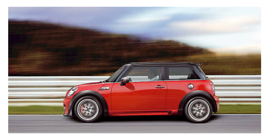
OTR prices are likely to be £20,500 for the MINI John Cooper Works and £21,700 for the MINI John Cooper Works Clubman.