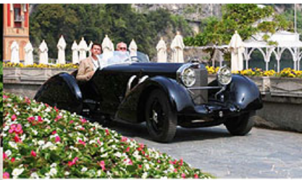
CIMBORO D'ITALIA DELLA DIESSE Carabinieri, 21-22 April 1977

The grand old tradition of the Salone Internazionale dell'Automobile di Torino, which was held in the city of Turin, Italy, from 1900 to 1977, was revived in 1977. The event was held in the city of Turin, Italy, from 1900 to 1977, and was held in the city of Turin, Italy, from 1900 to 1977. The event was held in the city of Turin, Italy, from 1900 to 1977, and was held in the city of Turin, Italy, from 1900 to 1977.