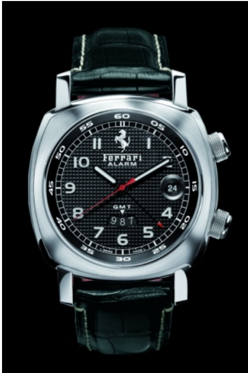
Panerai Ferrari Granturismo GMT Alarm

Few brands are as closely connected with motorsport as TagHeuer . The company's famous Carrera was first produced in 1964 and is named after the legendary Mexican Carrera Panamericana road race. The timepiece has been constantly developed by TagHeuer and the latest versions still carry the spirit of the original Carrera.