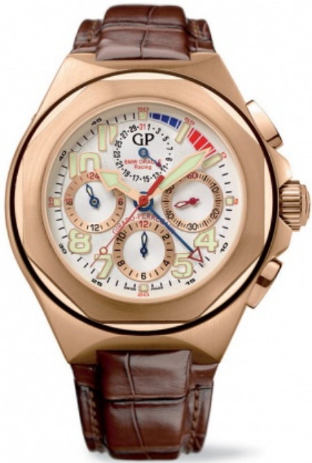
Girard-Perregaux Laureato USA 98