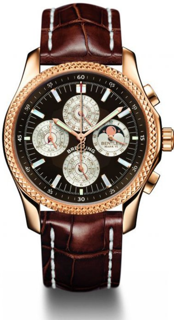
Blancpain Fifty Fathoms Chronographe Flyback