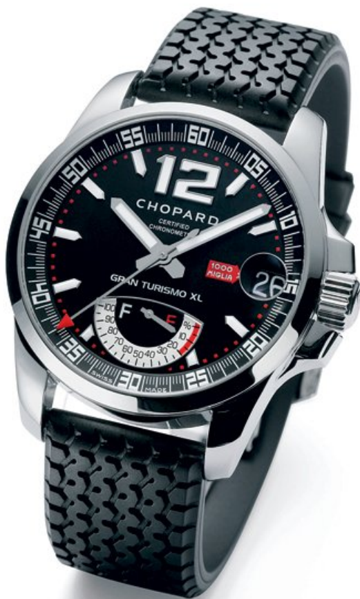
Patravi Chronograph Big Date with Diamond Bezel Chopard Mille Miglia Gran Turismo XL Power Control

'Go your own way and take the time to make the right decision for you. Take time to reflect on what you do – or don't do'. That's the philosophy of Swiss watchmakers Carl F. Bucherer , and no watch better encapsulates this dictum than its Patravi Chronograph Big Date with Diamond Bezel . Two versions are available: the first has a white watch dial with roman numerals and a python skin wrist strap in shades of beige and brown. The second has a black watch face with index markers and a wrist strap of Louisiana alligator leather.