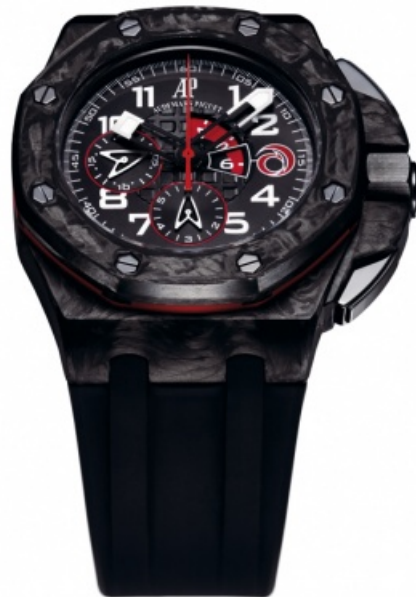
Audemars Piguet Royal Oak Offshore Alinghi Team

Let's start our round-up of watches with the White Ensign Red and Black Limited Edition from Arnold & Son . Just 250 pieces will be available worldwide of the 7-day, hand-wound, 'Manufacture' movement, single barrel chronometer. The back of the stainless steel case is fitted with a sapphire crystal revealing the mechanism, and carries its number in the limited edition series.