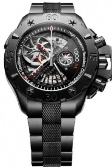
Zenith Defy Extreme Stealth

The Ferrari Granturismo Engineered by Officine Panerai collection is a series of watches designed by the famous Italian watchmaker, made in Switzerland, and imbued with the ethos of the wonderful GT cars from Maranello. One of the latest models is the Ferrari Granturismo GMT-Alarm . This not only has a second time zone function, but also an audible alarm. With its stainless steel case, square with rounded corners, and a partly polished, partly brushed finish, it's a 45mm watch water-resistant to a depth of 100 metres.