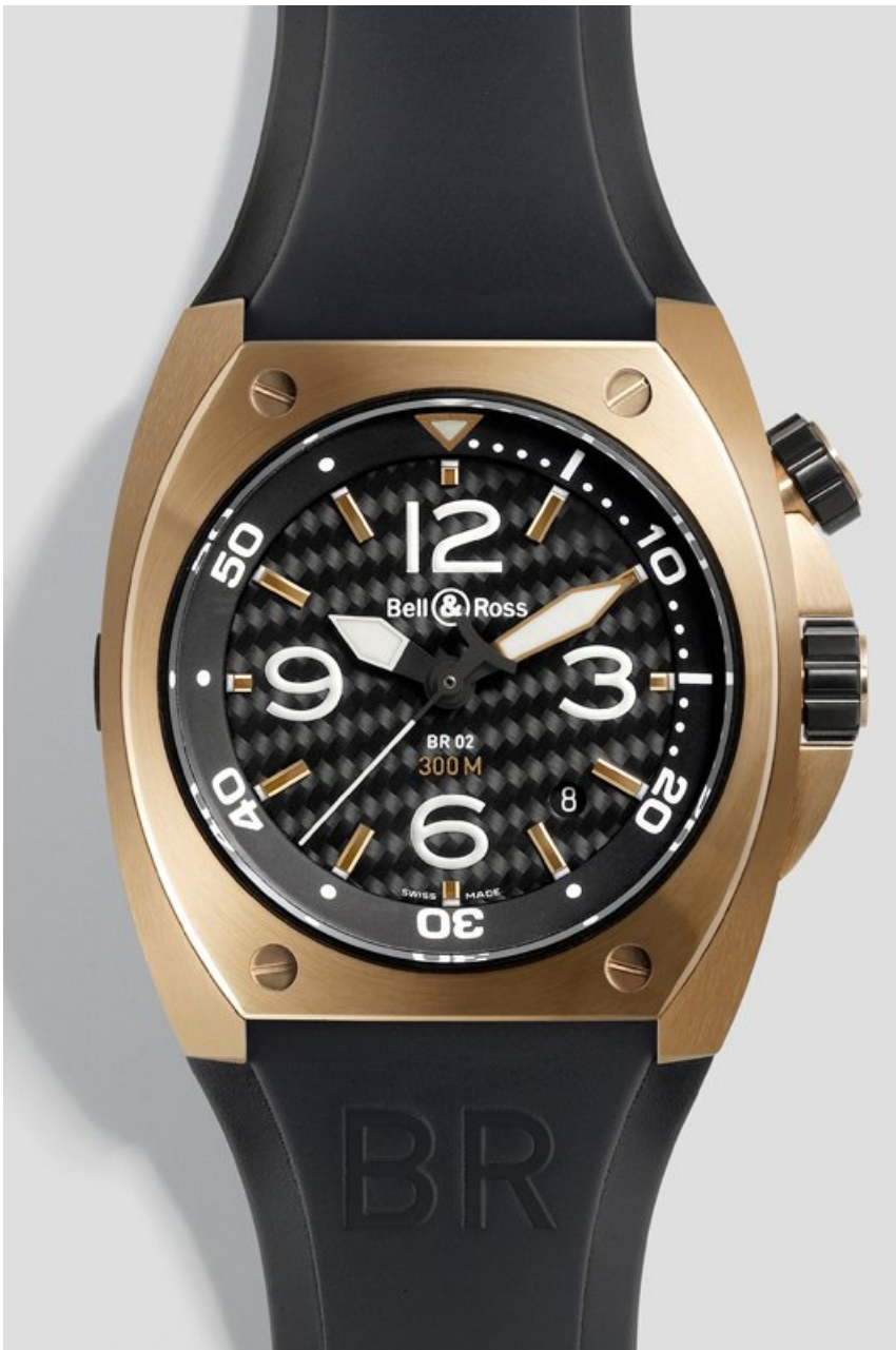
Baume & Mercier Hampton XL Magnum