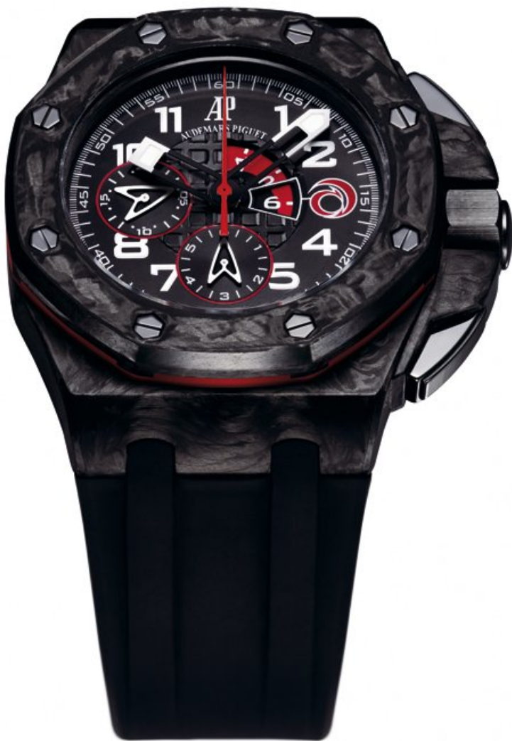
Arnold & Son White Ensign Red & Black Limited Edition