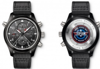
IWC Doppelchronograph Edition Top Gun

Set deep inside the rose gold case of the Girard-Perregaux Laureato USA 98 lies the company's GP033C0 movement. As a sponsor of the BMW ORACLE Racing yacht in this year's America's Cup the watch, limited to just 150 pieces, carries the team's legend on its dial and features a 10-minute countdown to the start of the race. The sleek lines of the USA 98 yacht are depicted by an engraving on the case back.