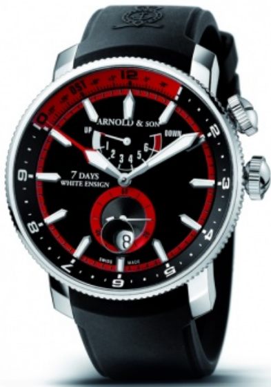
Arnold & Son White Ensign Red & Black Limited Edition