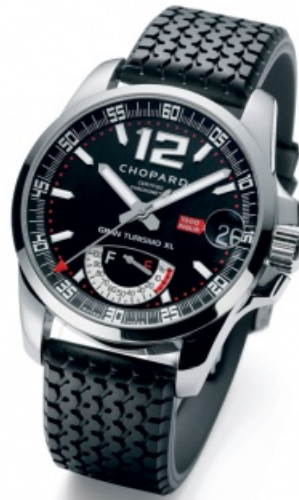
Patravi Chronograph Big Date with Diamond Bezel Chopard Mille Miglia Gran Turismo XL Power Control