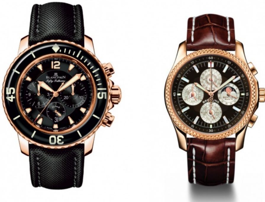
Blancpain Fifty Fathoms Chronographe

The latest model from Bell & Ross is the BR02 and for Christmas the French company has launched two gold versions of the highly proficient divers' watch. There is an all-rose gold watch, and a rose gold and carbon version that is water-resistant to 1,000 metres. At those depths, all watches are susceptible to pressure imbalances so all BRO2s feature a decompression valve opposite the winder.