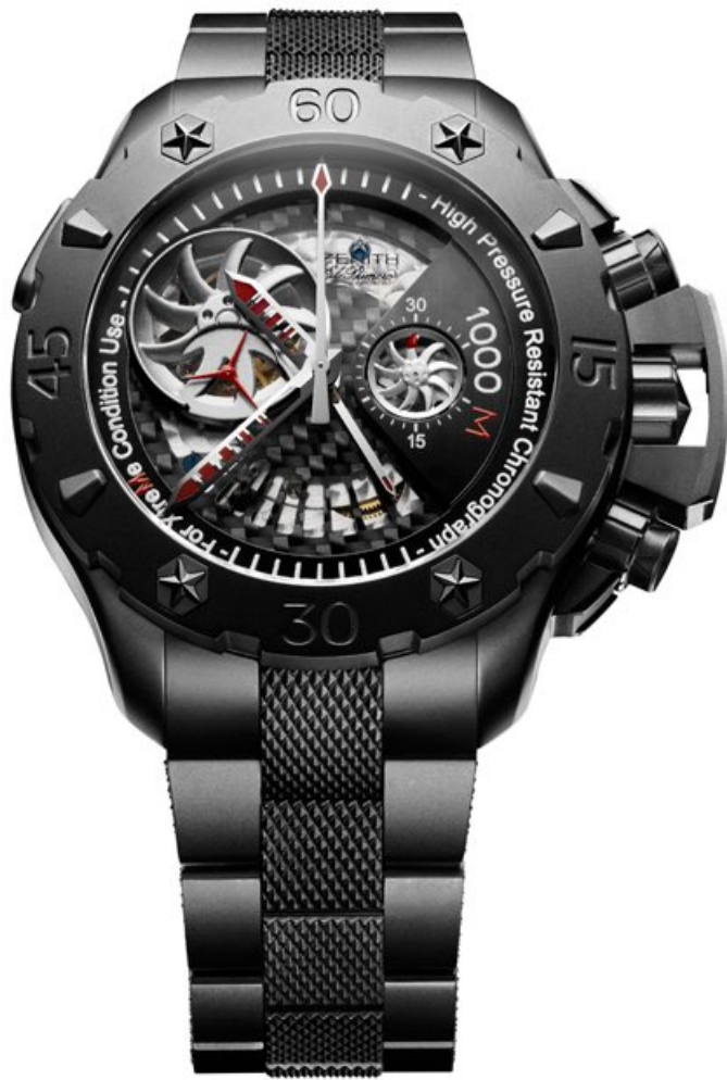
Panerai Ferrari Granturismo GMT Alarm