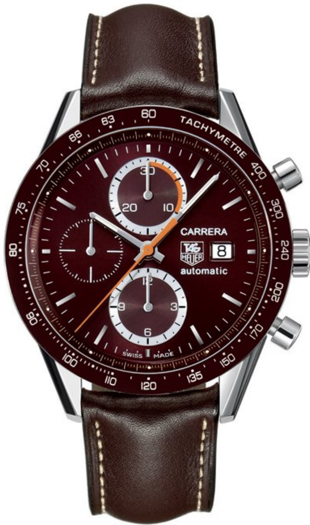
Jaeger-LeCoultre AMVOX2 Chronograph