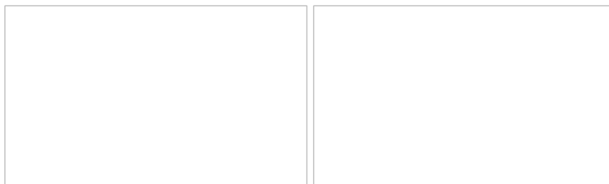
1992 Maserati Shamal - £16,000 to £18,000

The car is powered by a 2295cc, straight-six Fiat engine, based on the Lampredi-designed block used in the Fiat 1800 unit from 1959. Power is estimated at 135bhp which, in a car weighing a touch over 1000kg, allowed Abarth to advertise it as a 200km/h motor. The low weight was made possible by using aluminium doors, boot and bonnet, and the final result is a handsome Italian touring cabriolet. Barons is hoping to sell the car for between £23,000 and £30,000 on 31st July.