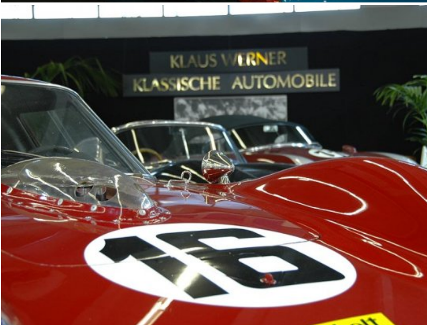
Text: Steve Wakefield