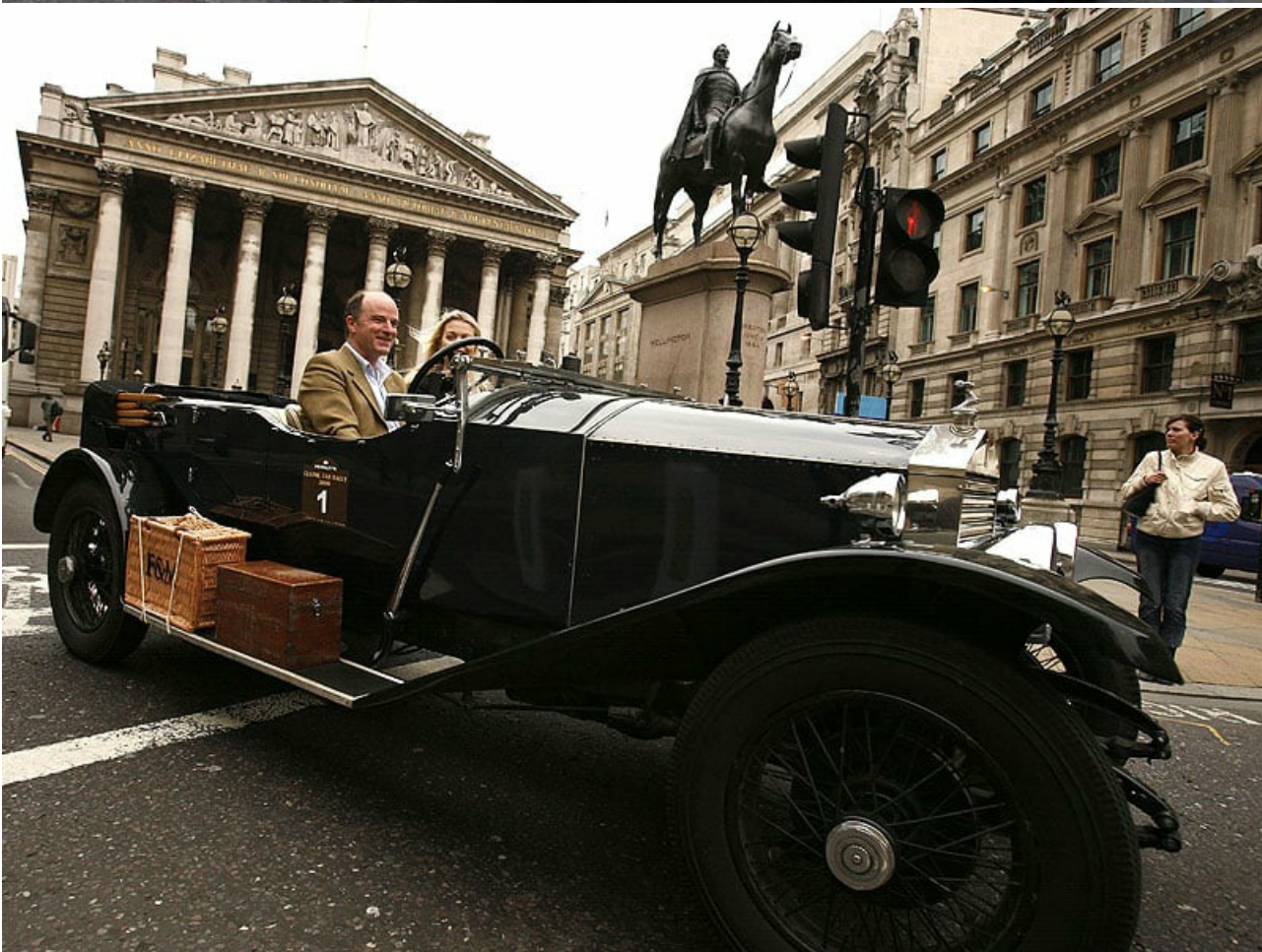
The 2007 Debrett's Classic Car Rally will be a run from London to Paris via Reims from Friday 4th to Monday 7th May (Bank Holiday Weekend). An event of high style, the rally will start from Leadenhall Market on Friday morning, stop overnight in Reims on Friday and Saturday as guests of Ruinart, and close with a run down the Champs-Elysees on the Sunday and a Celebration Dinner in Paris.