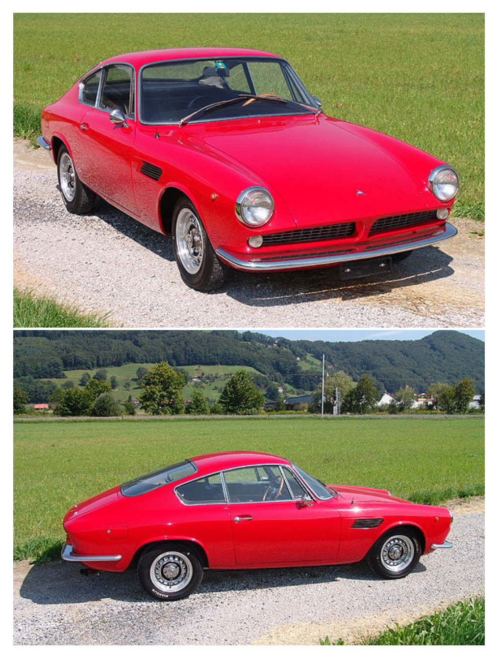
A little over 10 years later and another Italian company was making some jewel-like 'baby Ferraris', however the project never realised its founders expectations. The 1965 ASA 1000 GT , CHF 75,000 - 95,000, was intended to provide small-capacity motoring combined with very high performance. The 1,000cc cars were