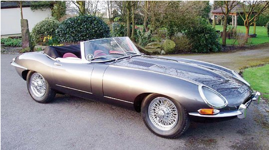
1961 Jaguar E-Type 3.8 'Flat-floor' Roadster - Sold for £50,525

H&H's next Sale will be at the Pavilion Gardens - Buxton, Derbyshire venue on 12 - 13 September 2006.