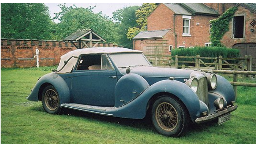
1939 Lagonda V12 Drophead Coupe - Sold for £81,700

H&H sold the 'barn find' 1939 Lagonda V12 well above estimate at £81,700 (including buyer's premium) at their recent Buxton Sale. Just one lot in a £1 Million + auction and the company was justifiably pleased with the results.