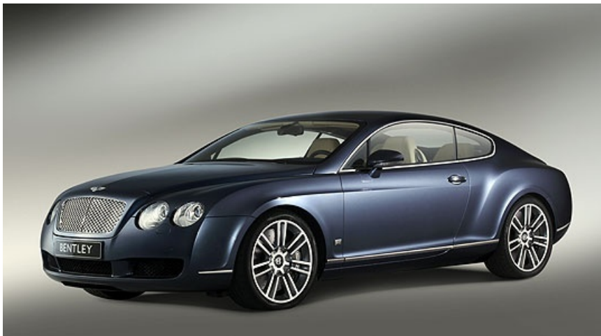
The Continental GT

The Arnage Diamond Series also sees the reintroduction to series production of the 'Flying B' mascot, a feature that last adorned the radiator of the Bentley T Series in the late 1970s.