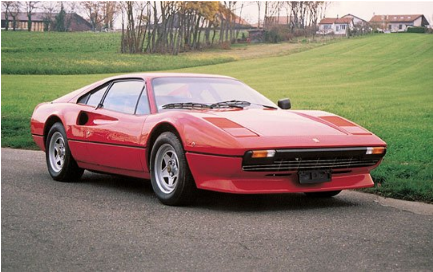
ex-Didier Pironi 1982 Ferrari 308GTBi Est. SFR 40.000 - 50.000

At a discount of almost 50% on new, who says you can't find a bargain nowadays?