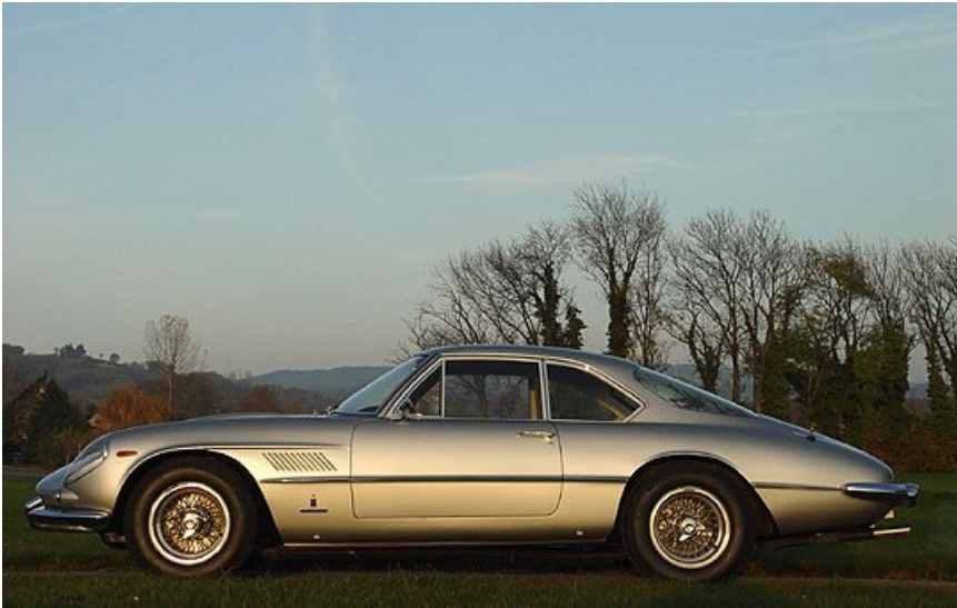
1964 Ferrari 400 Superamerica Aerodinamico Est.SFR 500.000 - 600.000

For their final motor car auction of 2005, Bonhams will present 27 Ferraris at one of the world's ritziest venues, Gstaad in Switzerland. Collectors can choose from various models of the marque from the 1950s onwards, many of them having famous owners in the past. Owners such as the French GP driver Didier Pironi, whose 308 GTBi comes from his widow, and is the car in which he frequently dived with Gilles Villeneuve on their way to all the European Grands Prix